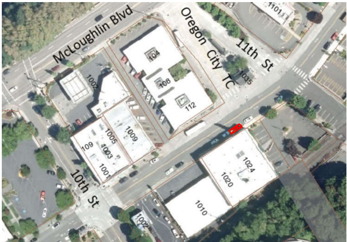
Main Street from 10 th Street to 11 th Street