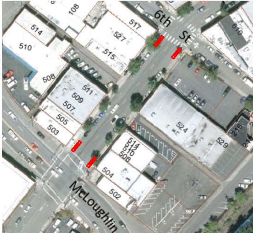
Main Street from 6 th Street to Hwy 99E