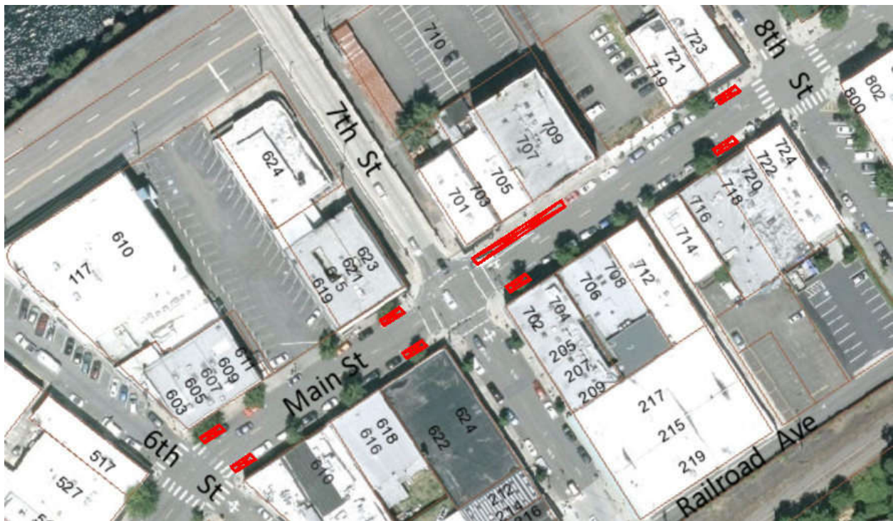
Main Street from 6 th Street to 8t Street