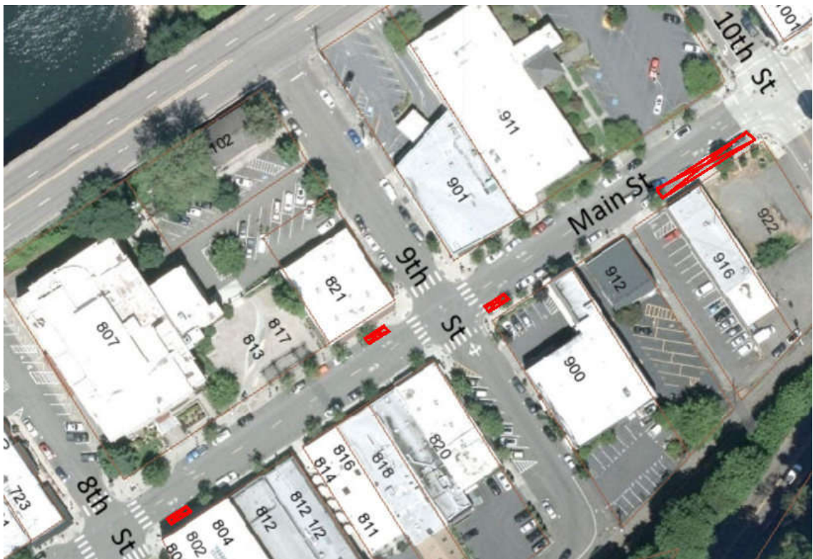
Main Street from 8 th Street to 10 th Street