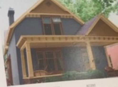
BODY TRIM ACCENT