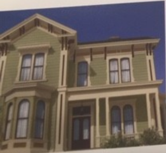
TRIM ACCENT ACCENT 2