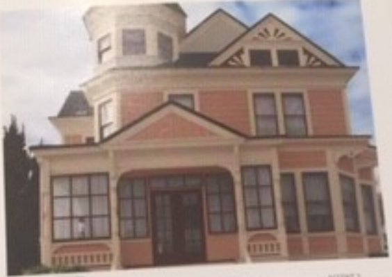
BODY TRIM ACCENT ACCENT 2