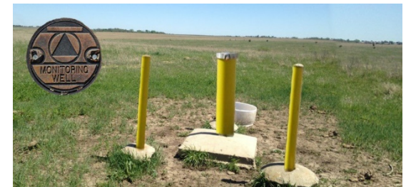
Monitoring Wells in the ROW

Quite often, we find that businesses or property owners need to acquire their temporary obstruction permit. Also, don't forget to renew annually!