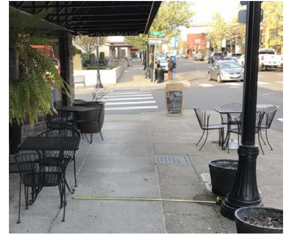
Measuring Sidewalk ADA Clearance

Quite often, we find that businesses or property owners need to acquire their temporary obstruction permit. Also, don't forget to renew annually!