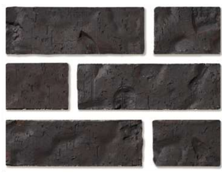
BRICK VENEER BASE, IRON WASH