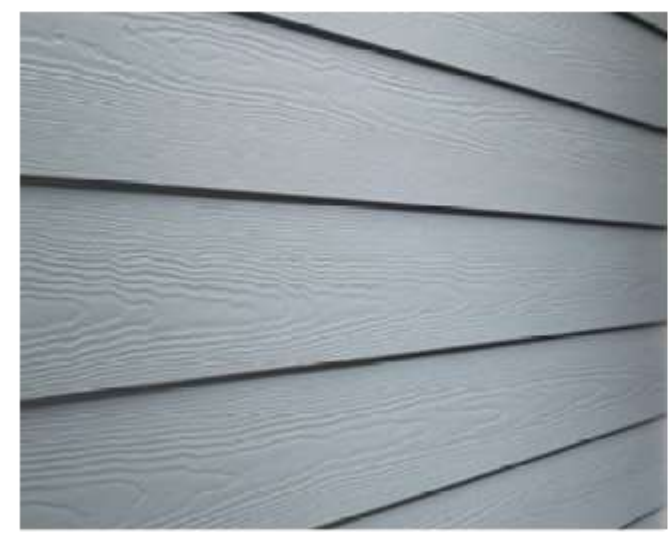
PAINTED FIBER CEMENT LAP SIDING