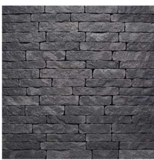
STONE VENEER BASE, ONYX