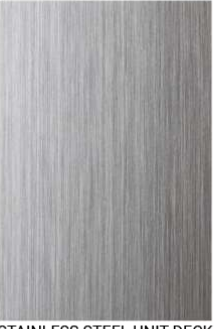
STAINLESS STEEL UNIT DECK RAILINGS