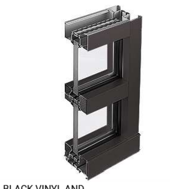
BLACK VINYL AND STORE FRONT WINDOW SYSTEMS