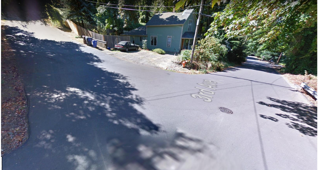
Intersection of 3 rd Ave and Ganong Street looking in a southeasterly direction