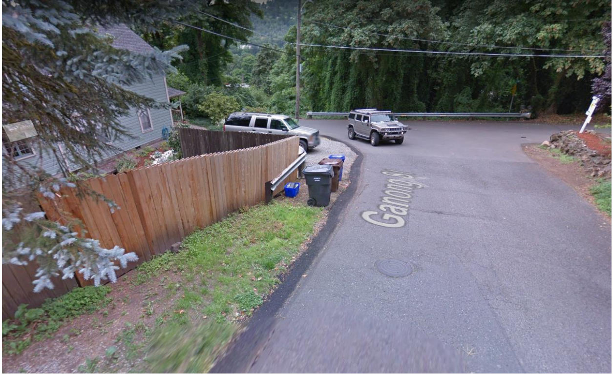
Looking westward on Ganong Street almost to the intersection with 3 rd Ave.