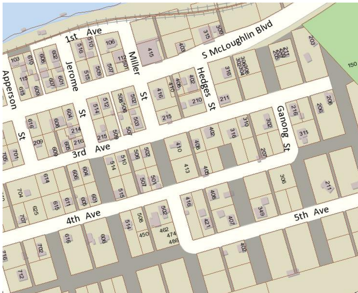
Location Map – 302 3 rd Street at the intersection of 3 rd and Ganong