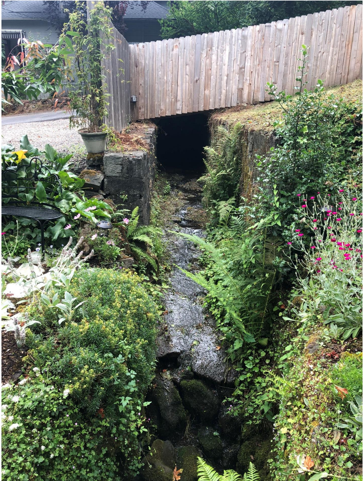
302 3 rd Street; On private property looking upstream of Coffee Creek, towards Ganong Street