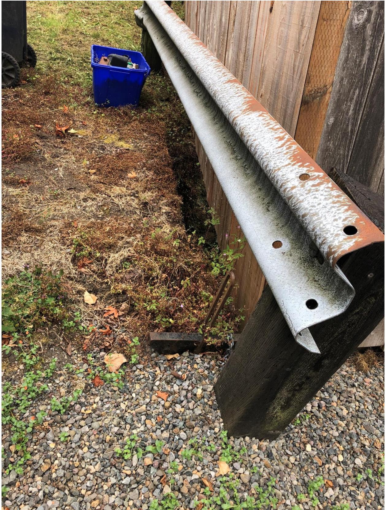
Fence and guardrail fronting 302 3 rd Avenue but along Ganong Street