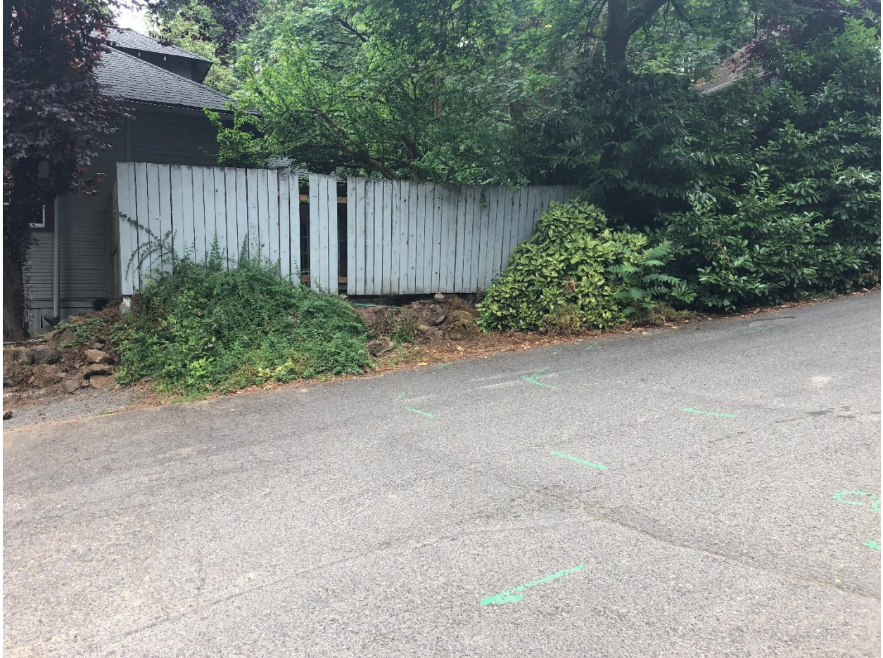
Ganong Street looking from 302 3 rd Ave. towards 216 3 rd Ave.; green utility locates indicate location of Coffee Creek.