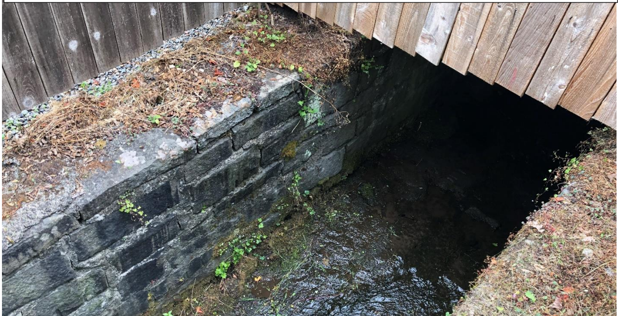
Historic basalt channel of Coffee Creek; Creek channel in the public ROW.