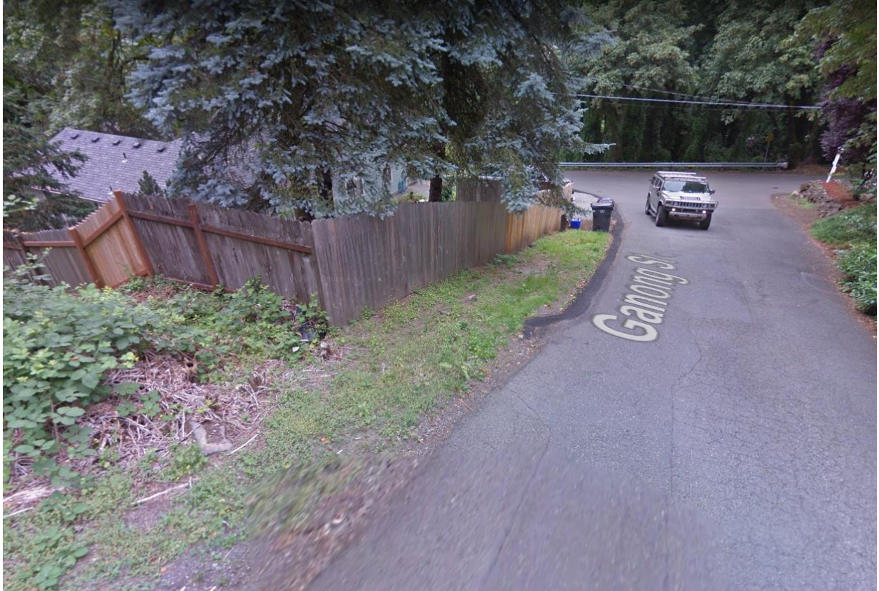
Looking westward from 4 th Ave. to 3 rd Ave. about midway on Ganong Street