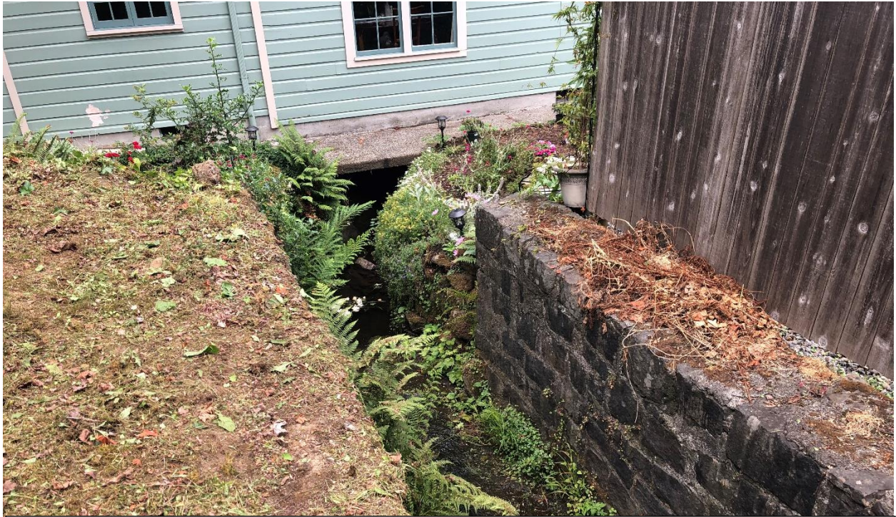
Historic basalt channel of Coffee Creek looking towards 302 3 rd Ave on private property.