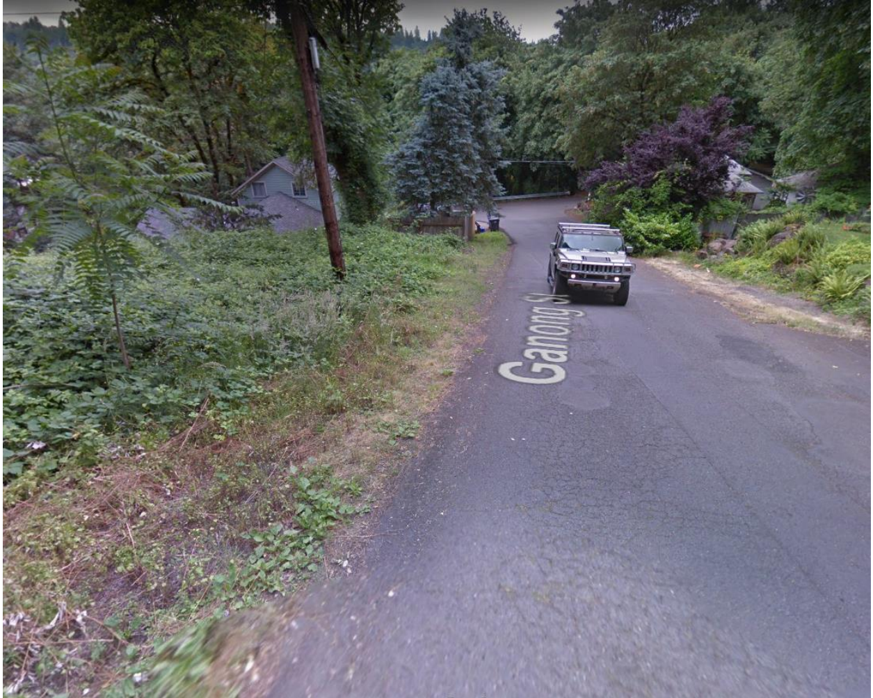
Looking westward on Ganong from 4 th Ave to 3 rd Ave.