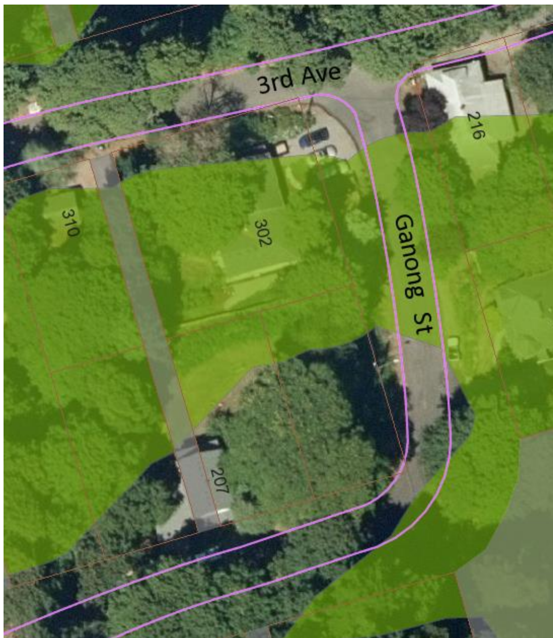
Title 3 Riparian Area