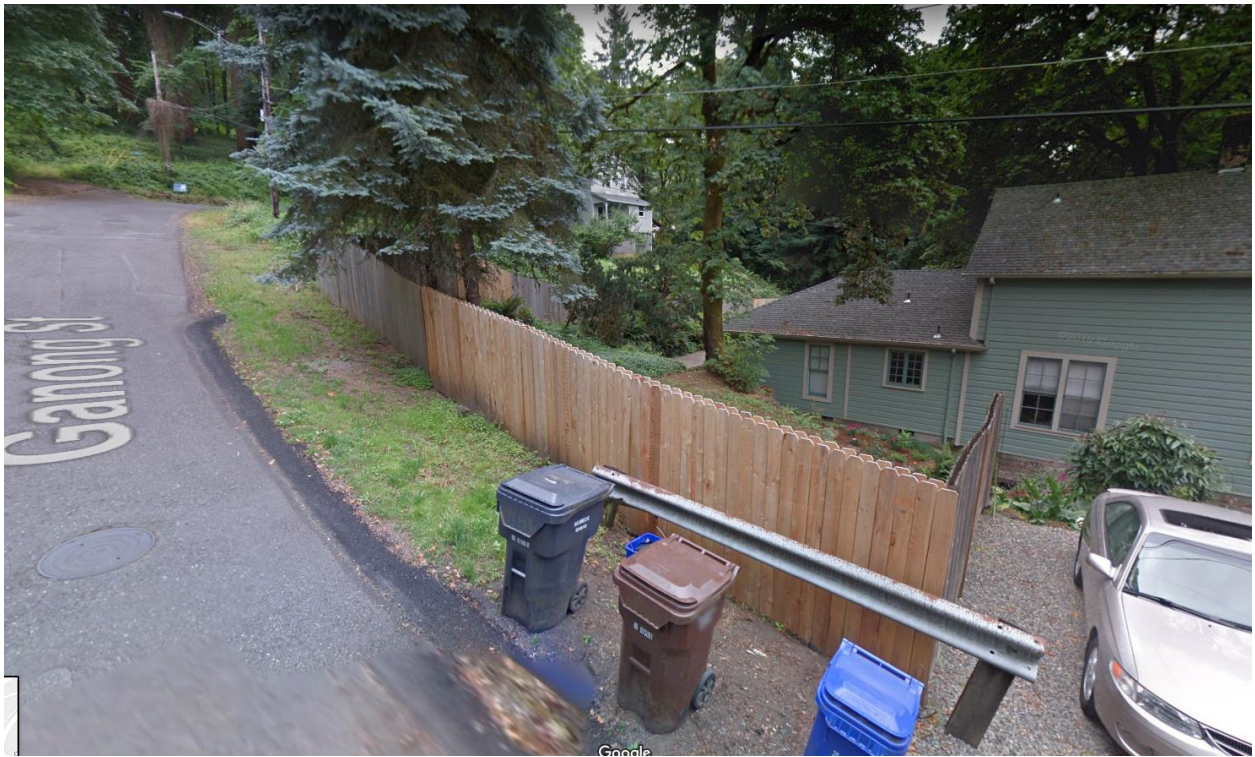
Looking eastward toward 4 th Avenue, about midblock on Ganong Street