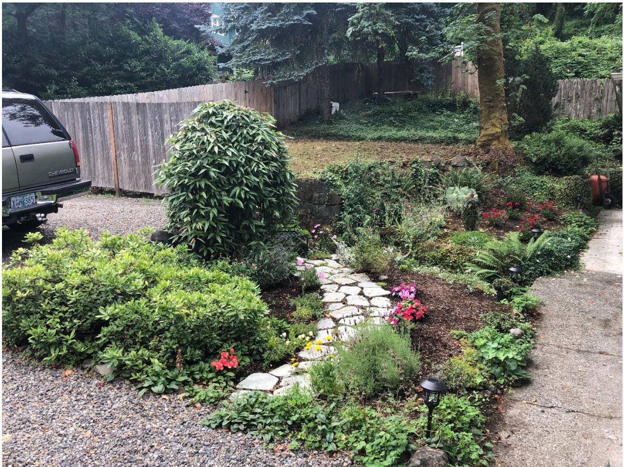
302 3 rd Ave; On private property looking towards Coffee Creek