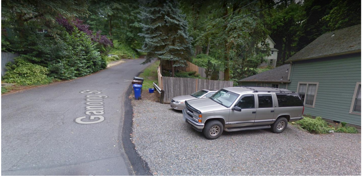
Street View looking eastward on Ganong Street from 3rd Street