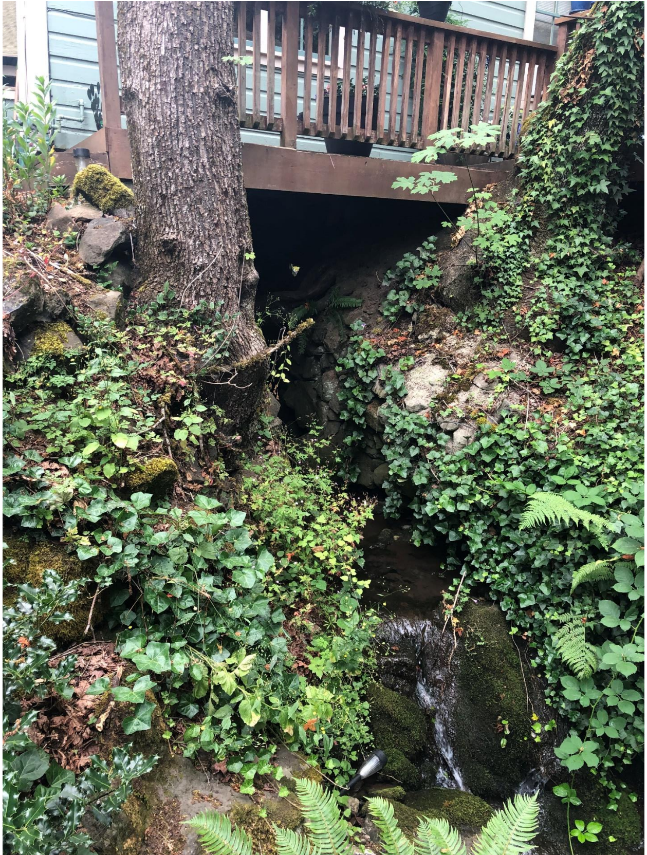
Coffee Creek looking upstream towards home on 302 3 rd Ave. Private property