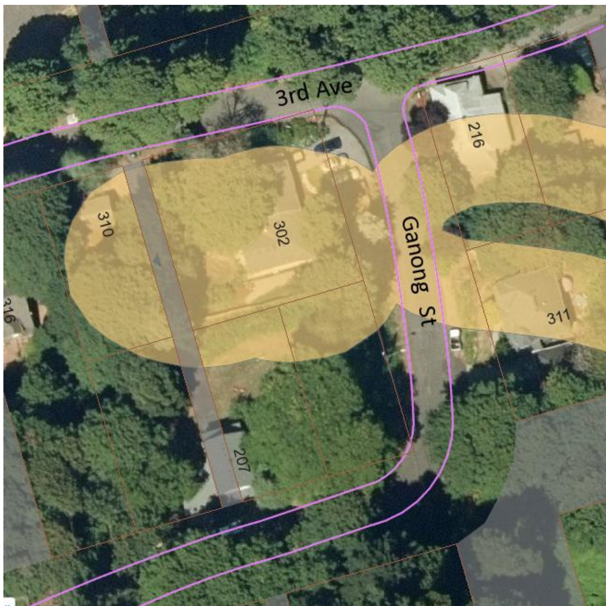
Title 3 Wetland Vegetated Corridor