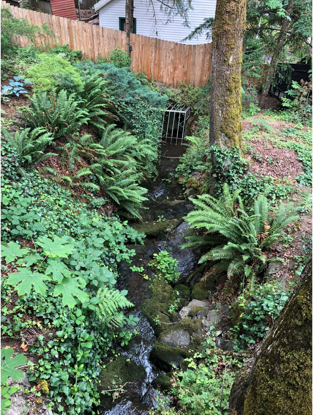
Coffee Creek; downstream of the home at 302 3 rd Ave looking towards 310 3 rd Avenue. Private property.