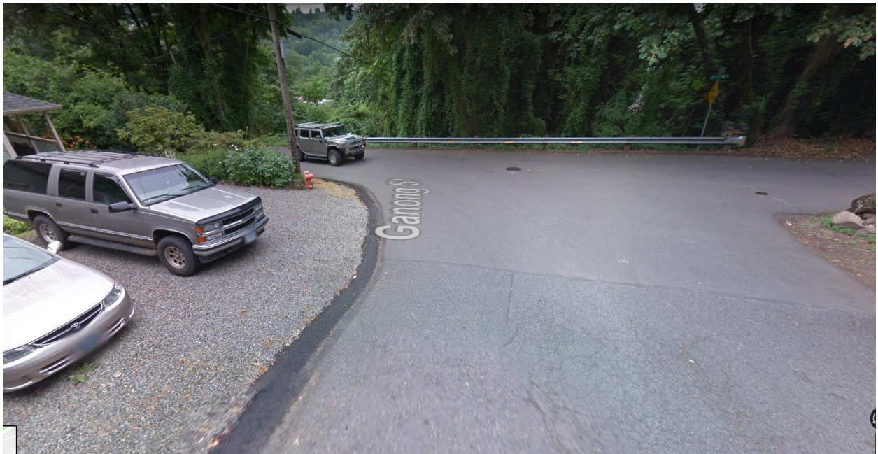
Intersection view westward at 3 rd Ave. and Ganong Street looking from Ganong Street seeing a vehicle traveling north to eastbound