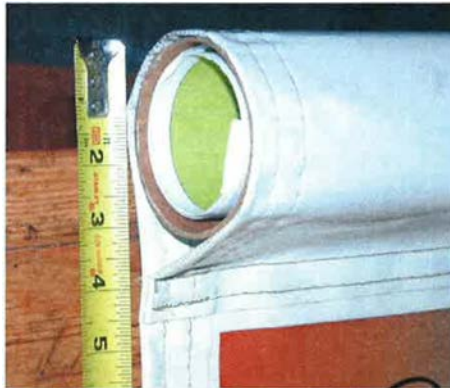
Banner Pocket 4"