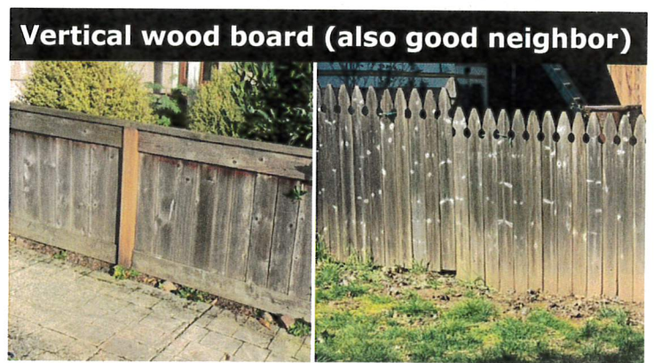
Vertical wood board (also good neighbor)