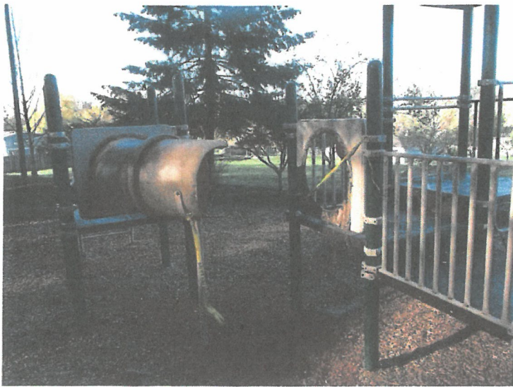
Damage is estimated at more than $1,000 after the fire on the play structure at Park Place Park.

Anyone who has information about the fires or about the person responsible for setting the fires is asked to call OCPD at 503-496-1616 or Clackamas Fire at 503-742-2660.