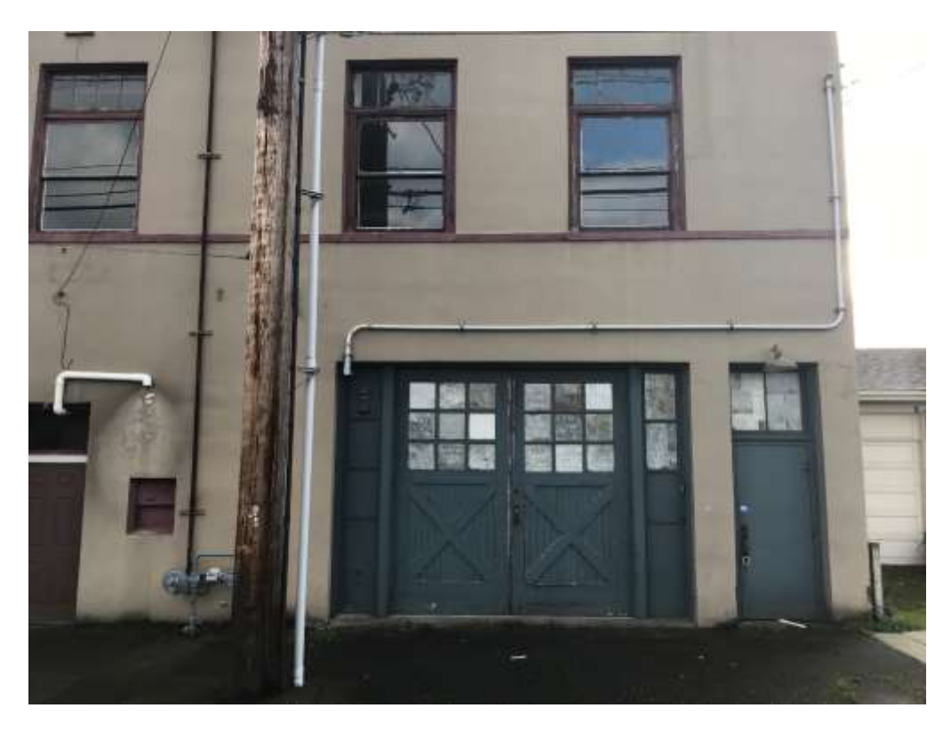
Figures 3-4: Washington Street façade