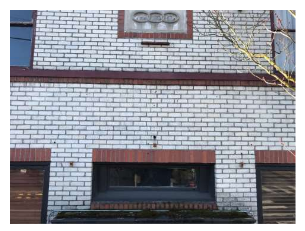
Figures 1-2. 7<sup>th</sup> Street Facade