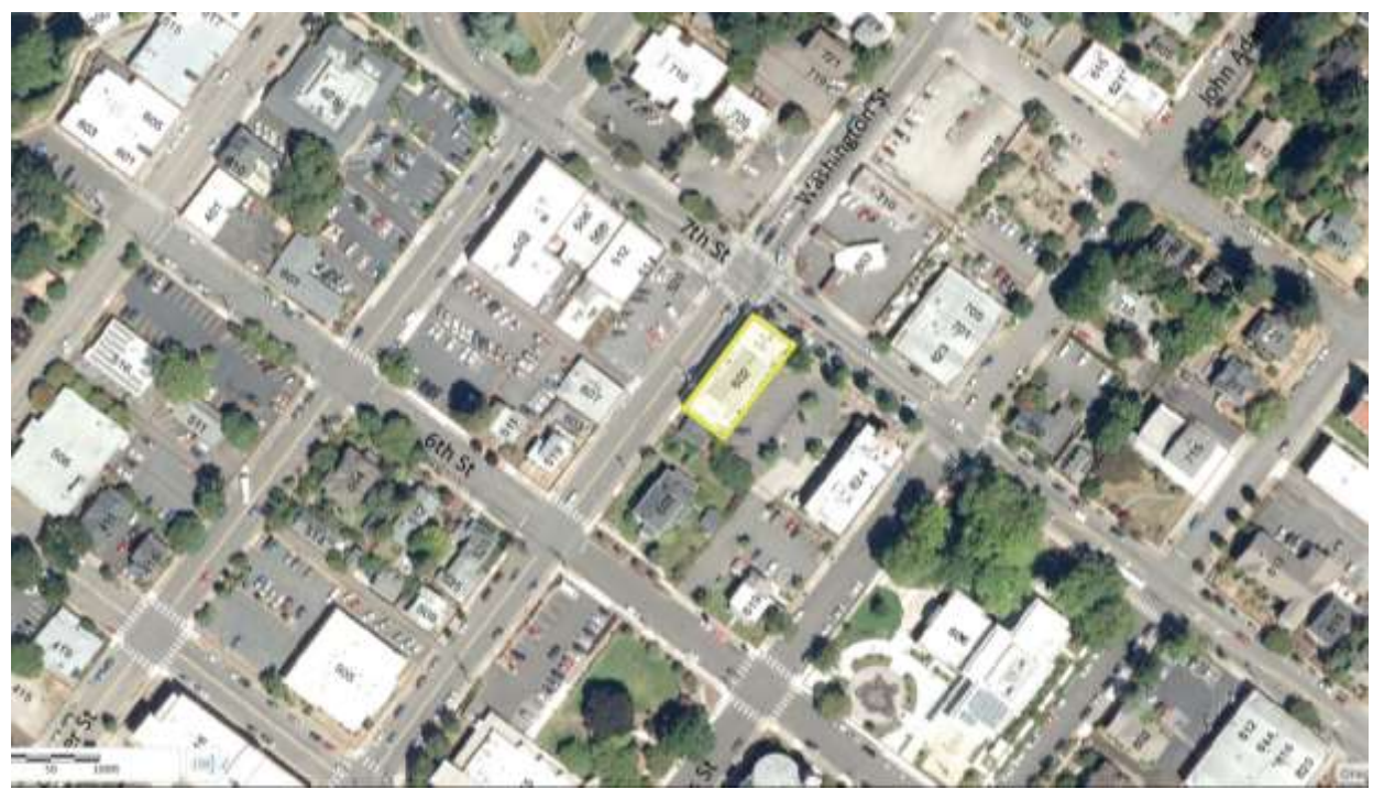
Figure 5. Project Location