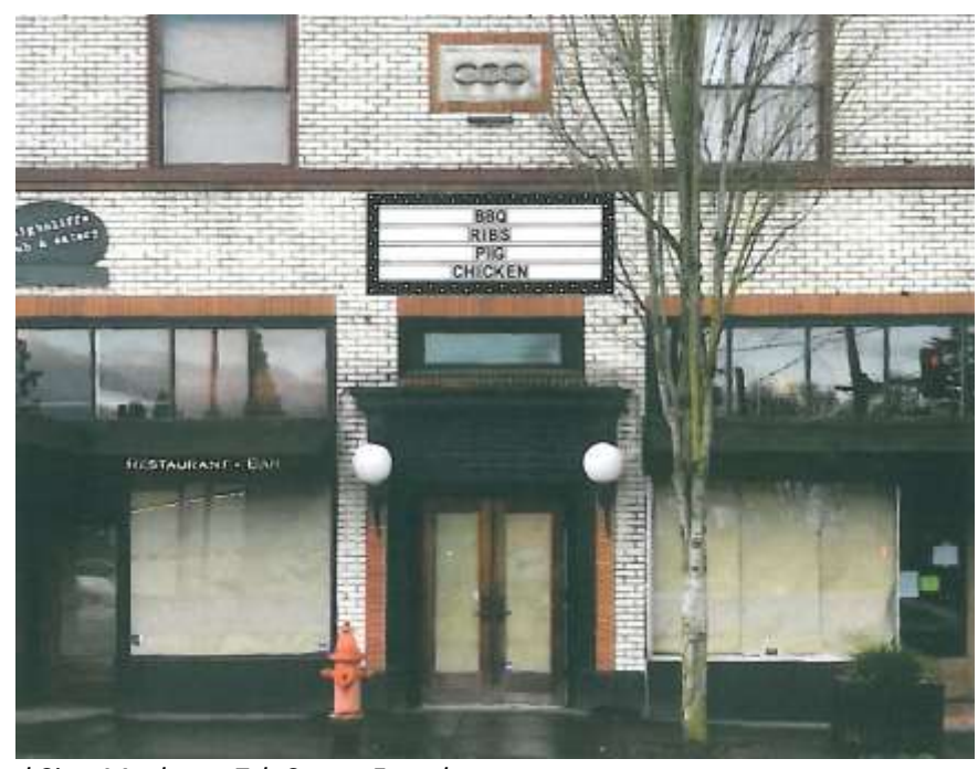
Figure 4. Proposed Sign Mock-up: 7th Street Façade

Regarding size allowances in Chapter 15.28: The 7<sup>th</sup> street façade allows for 52 square feet of projecting/wall signs, total. The proposed wall sign is 31 square feet. The Washington Street facade allows for 121 square feet of projecting/wall signs, total. The proposed wall signs on the Washington St facade are 31 square feet combined. The projecting sign on the corner is about 36 square feet and can be counted toward the Washington Street façade or you can split the size between each façade, since it is on the corner. The proposed projecting sign is within the maximum projection allowed by code.