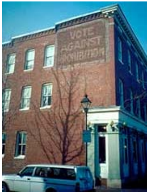
This fading sign was painted in Baltimore in 1931 or 1932. It survives from the campaign to enact the 21st amendment to the United States Constitution, which repealed prohibition.

Preserving historic signs is not always easy. But the intrinsic merit of many signs, as well as their contribution to the overall character of a place, make the effort worthwhile. Observing the guidelines given below can help preserve both business and history.