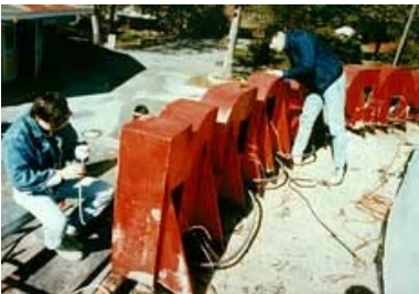
Workers prepare the "metal cans" from a sign for re-mounting.

Neon signs can last 50 years, although 20-25 years is more typical. When a neon sign fails, it is not because the gas has "failed," but because the system surrounding it has broken down. The glass tubes have been broken, for example, thus letting the gas escape, or the electrodes or transformers have failed. If the tube is broken, a new one must be made by a highly skilled "glass bender." After the hot glass tube has been shaped, it must undergo "purification" before being refilled with gas.