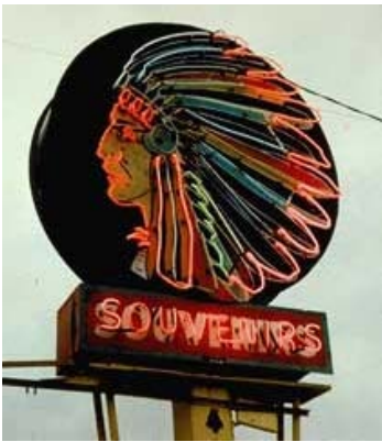
Neon first appeared in signs in the 1920s, and reached its height of popularity in the 1940s.

Fascia signs , placed on the fascia or horizontal band between the storefront and the second floor, were among the most common. The fascia is often called the "signboard," and as the word implies, provided a perfect place for a sign—then as now. The narrowness of the fascia imposed strict limits on the sign maker, however, and such signs usually gave little more than the name of