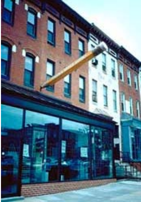
Objects associated with a business continue to be used as signs.

Moving signs were not unknown prior to the advent of electricity, for wind-driven signs had