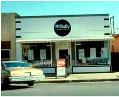
In the 1930s and 1940s, signs built into storefronts became popular. This example is from Guthrie, Oklahoma.

made their appearance in the nineteenth century. But electricity gave signs an unparalleled range of motion. This movement added yet another element to the life of the street.