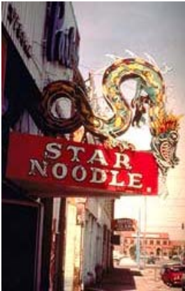
This Ogden, Utah, sign is a superb example of neon.

However, early efforts by municipalities to enact sign regulations met with disfavor in the courts, which traditionally opposed any