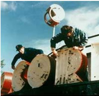
Neon fabricators are installing the new tubing in the repaired and remounted