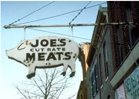
This hanging pig is delightful, even without its neon. Holes show where tubing was attached. It has been a local landmark in Baltimore's Fells Point neighborhood for over 60 years.

Historic signs once allowed buyers and sellers to communicate quickly, using images that were the medium of daily life. Surviving historic signs have not lost their ability to speak. But their message has changed. By communicating names, addresses, prices, products, images and other fragments of daily life, they also bring the past to life.