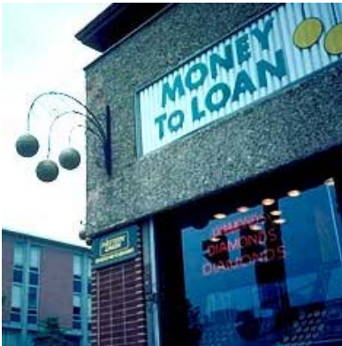
Once commonplace, the three balls symbolizing the pawnbroker are now rare.