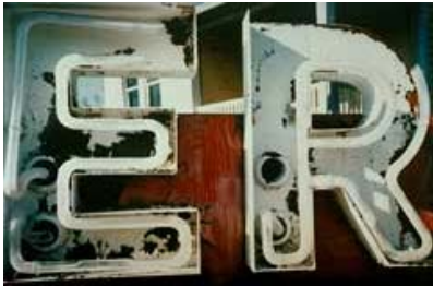
These tubes in this amusement park's sign were broken and the surrounding "metal cans" needed work also. See below.

Preserving old signs is one thing. Making new ones is another. Closely related to the preservation