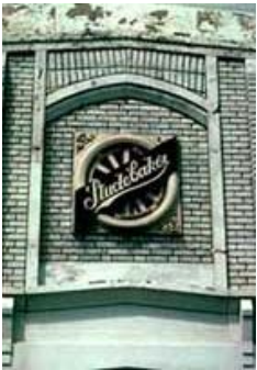
Terra cotta wheel with Studebaker banner, 1926. Lakewood, Ohio.

"Signs" refers to a great number of verbal, symbolic or figural markers. Posters, billboards, graffiti and traffic signals, corporate logos, flags, decals and bumper stickers, insignia on baseball caps and tee shirts: all of these are "signs." Buildings themselves can be signs, as structures shaped like hot dogs, coffee pots or Chippendale highboys attest. The signs encountered each day are seemingly countless, for language itself is largely symbolic. This Brief, however, will limit its discussion of "signs" to lettered or symbolic messages affixed to historic buildings or associated with them.