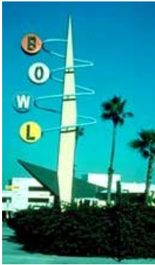
In the late 1950s and early 1960s, the country turned its attention to outer space, as in this example in Long Beach, California.

As the century advanced, new styles took hold. The late 1950s brought signs with fins, star bursts, and other images reflecting a new fascination with outer space.