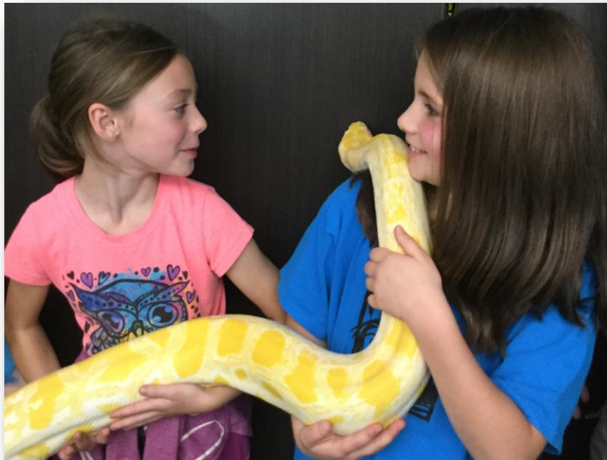
Two girls look at the albino python they're holding between them.