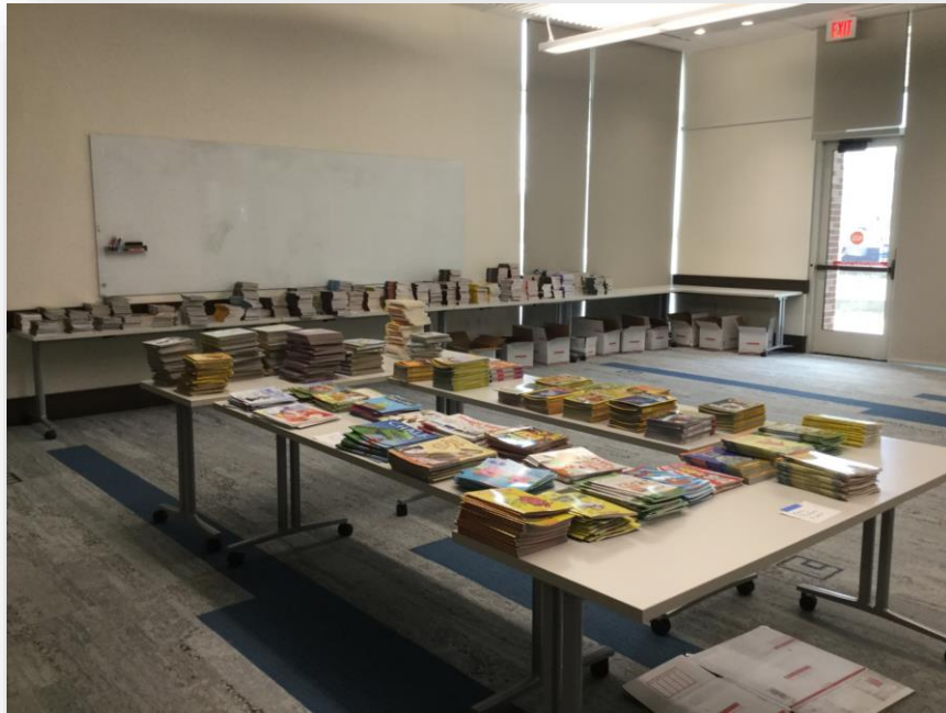
Some of the prize books being sorted in the Community Room