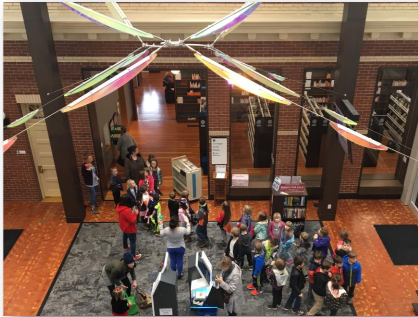
A class of 30 first graders stands in the lobby during their tour