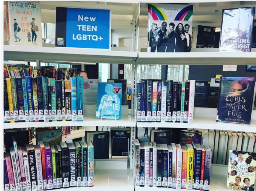
LGBTQ+ collection on its first day on the shelves