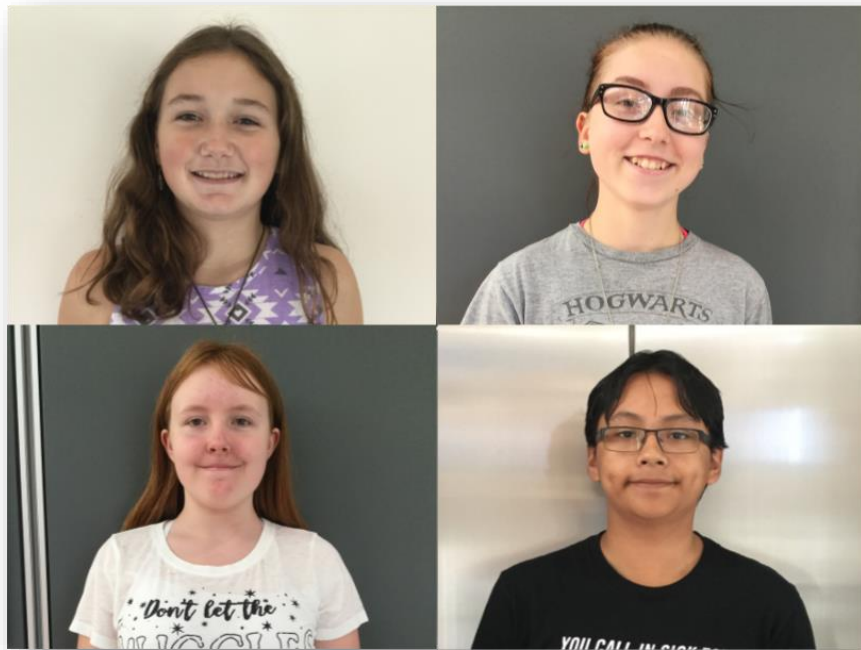
A collage of four middle school student volunteers

Our Teen Advisory Group is 9 students in grades 7-12 who: