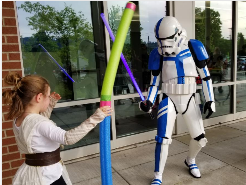
A girl dressed as Rey duels a Storm Trooper with her pool noodle lightsaber

Our annual Star Wars Day party will be held on Saturday, May 4.