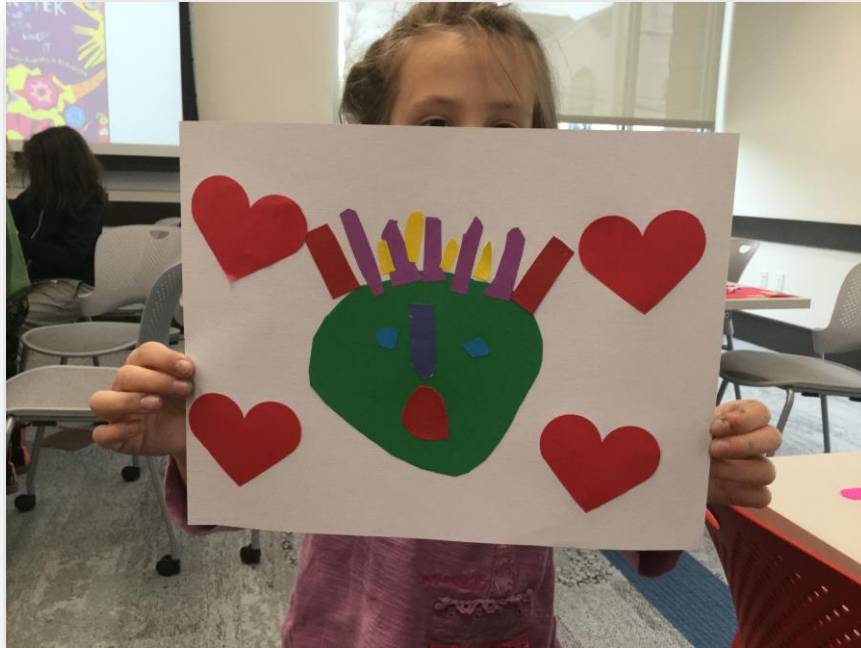
A girl holds up a collage of a monster surrounded by hearts