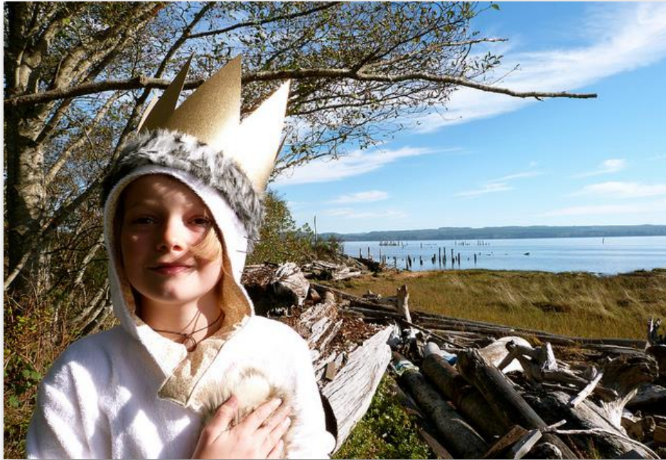
A child dressed as Max, wearing a white wolf suit and crown