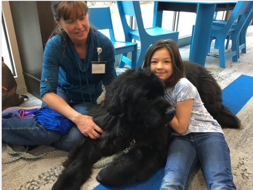
A girl hugs a black Newfoundland dog at Read to the Dogs