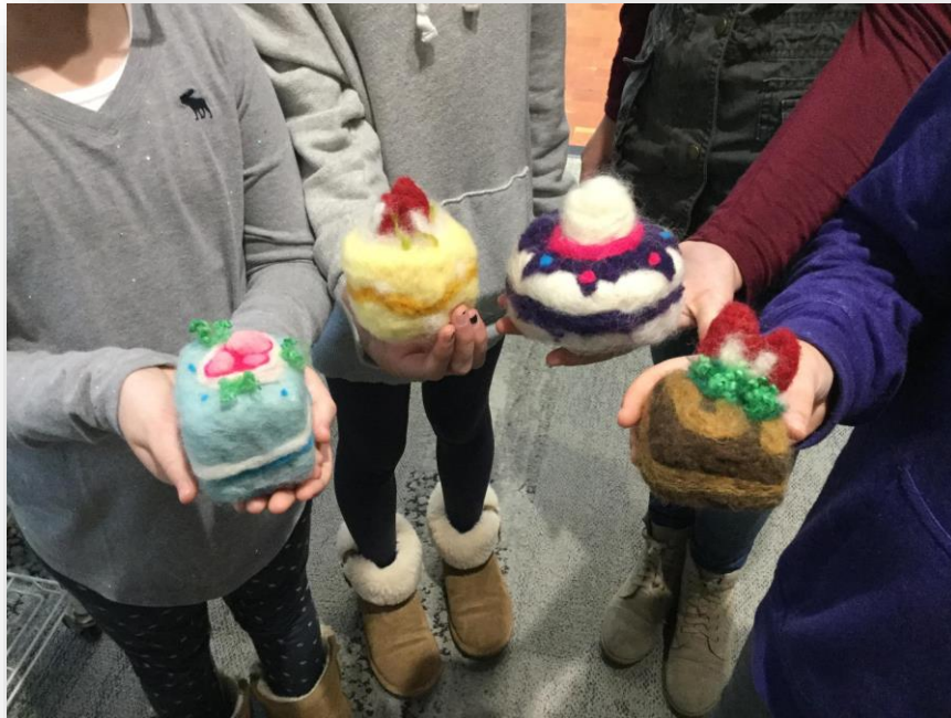
Four tween girls stand in a semi-circle holding felted cakes

On the 3 rd Saturday of each month, we offer a hands-on maker class for young teens age 10-14. Some popular 2018-19 events have been: