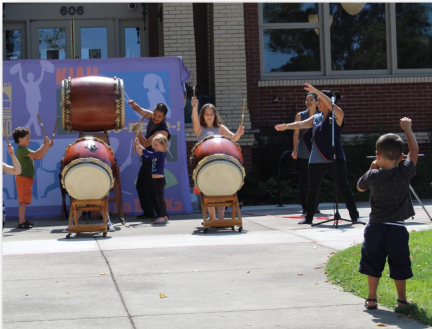
Kids watch and assist taiko drummers in front of the Carnegie

In addition to our weekly storytimes and Art Labs, we'll be offering special events: