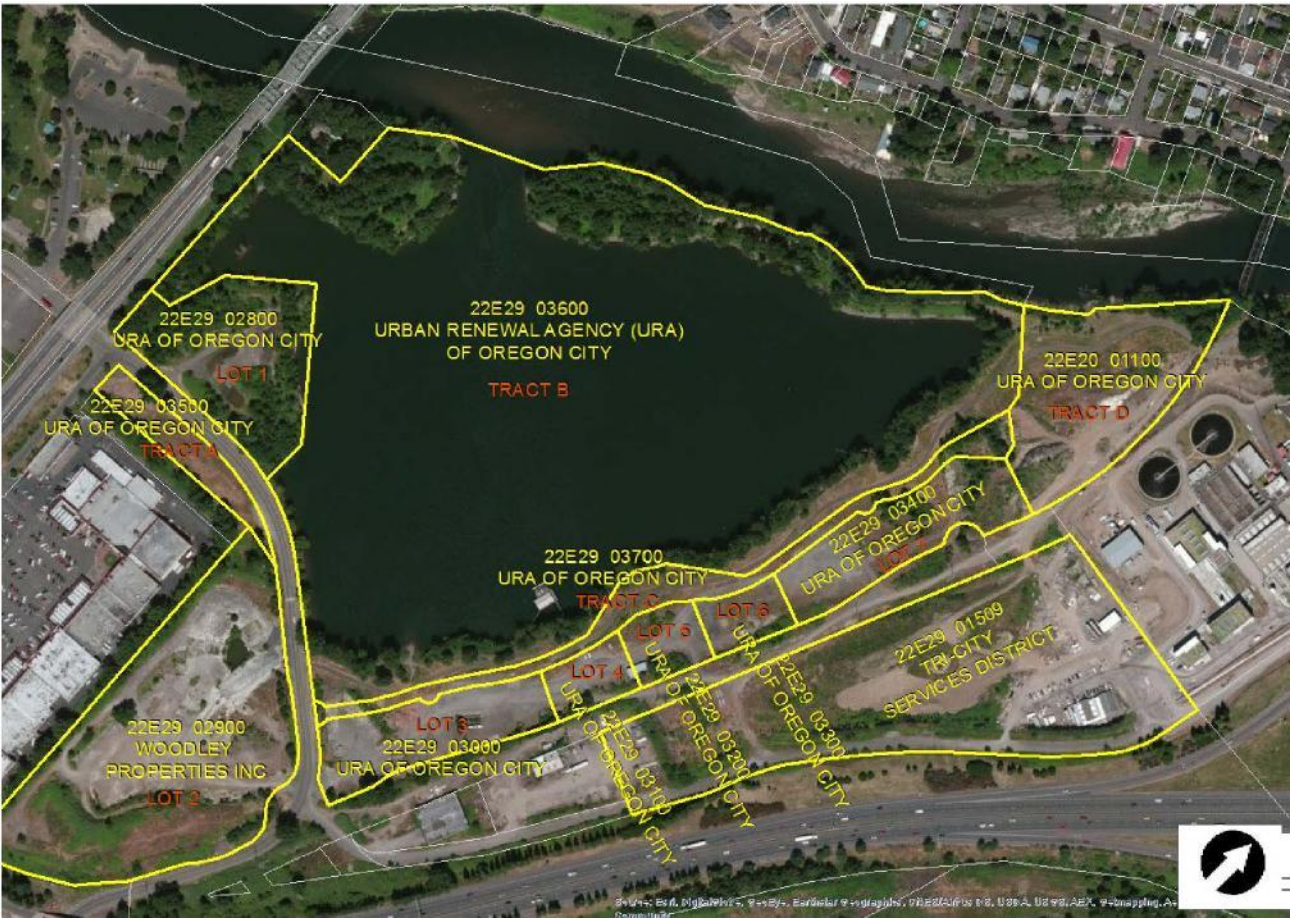
Figure 1. Aerial Map

The entire site is located within the Urban Growth Boundary and city limits of Oregon City and is included in the tax lots noted below.