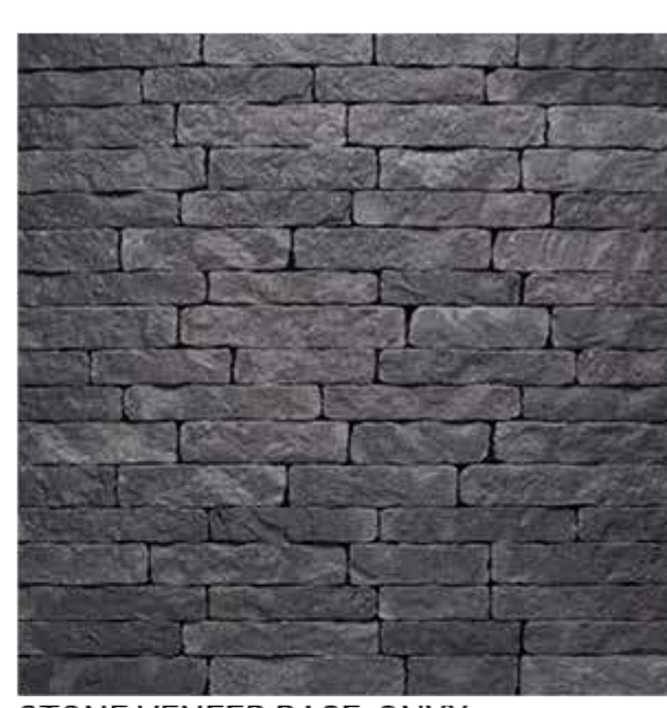
STONE VENEER BASE, ONYX