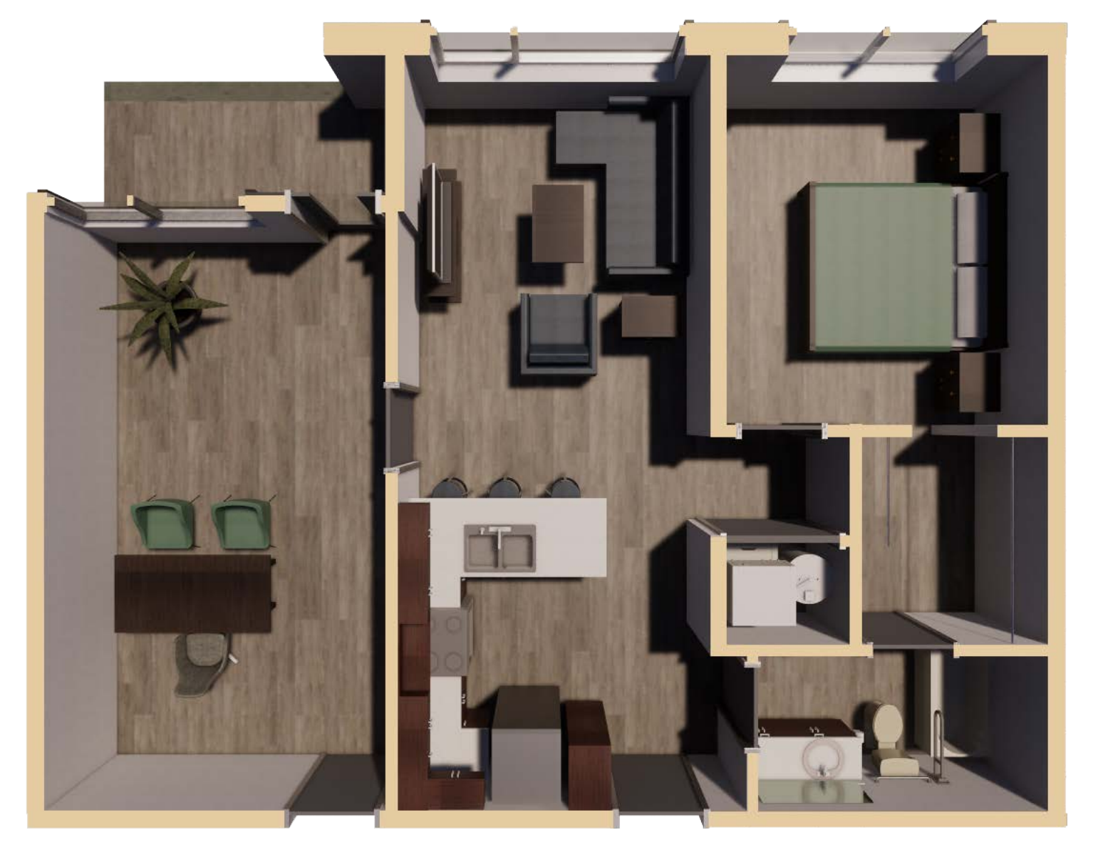
LIVE/WORK ONE BEDROOM