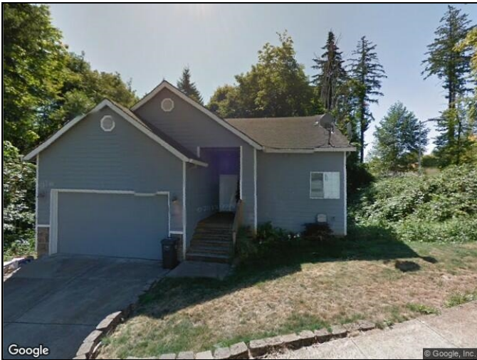
Google Streetview photo locations are approximate