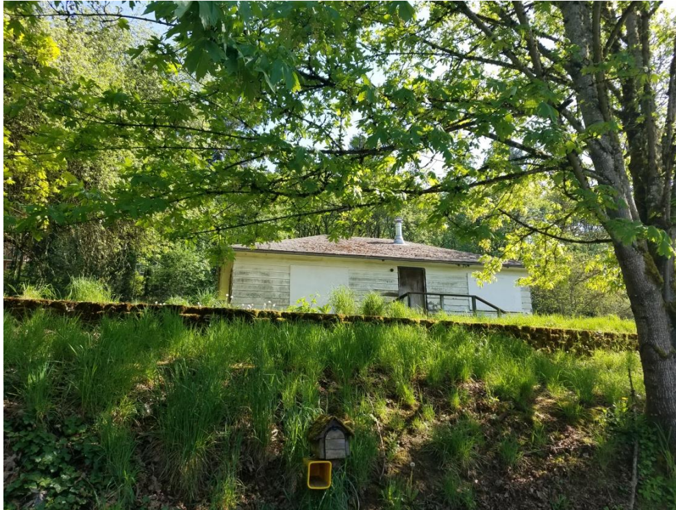
616 4 th Ave- New home will share driveway off 4 th Ave

1307 Seventh Street Oregon City, OR 97045 p: 503-656-1942 f: 503-656-0658