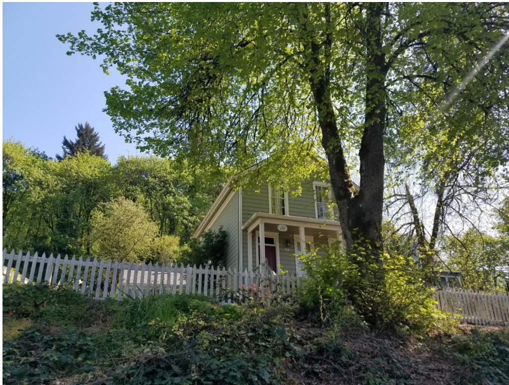
702 4 th Ave- A.E. Davis Hous (c. 1885) Southwest of project site