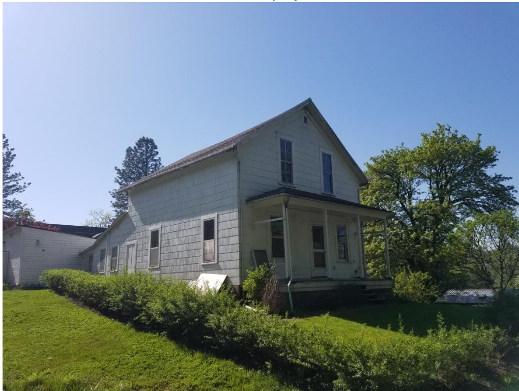
803 5 th Ave- Edward and LC Nuttal House (c. 1895) South of project site