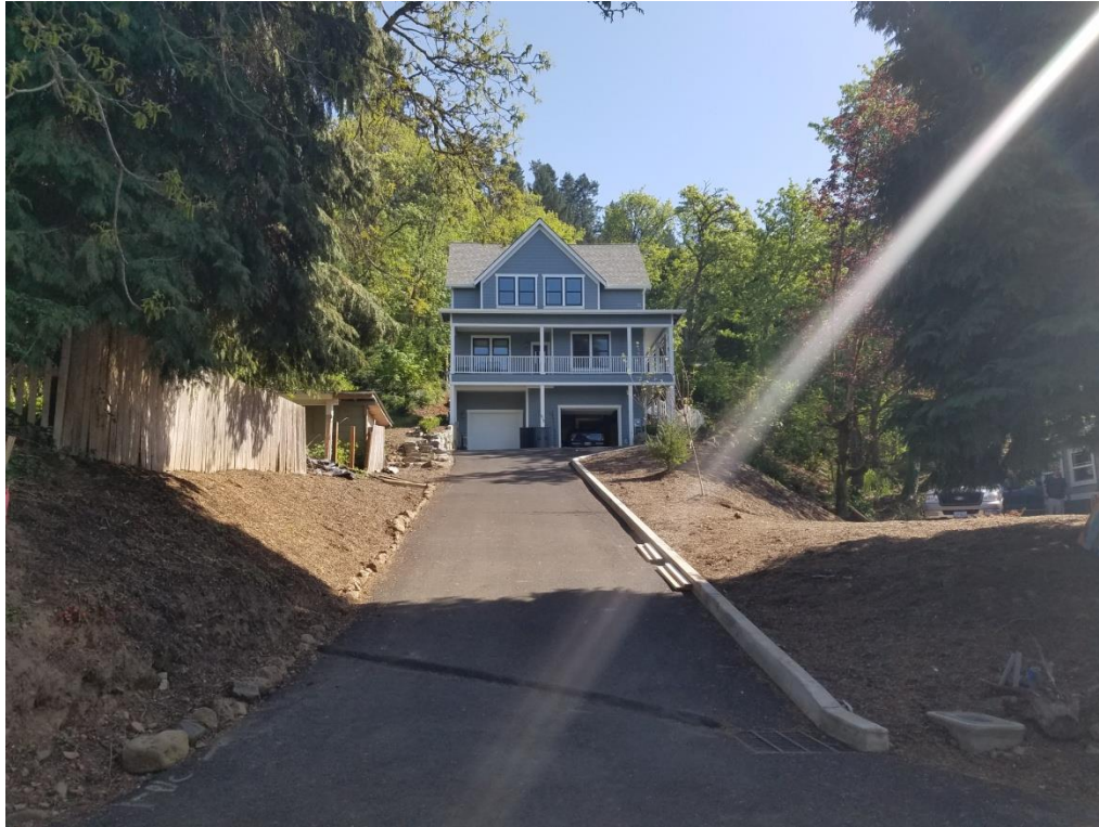
712 4 th Ave- New home to Southwest of project site

1307 Seventh Street Oregon City, OR 97045 p: 503-656-1942 f: 503-656-0658