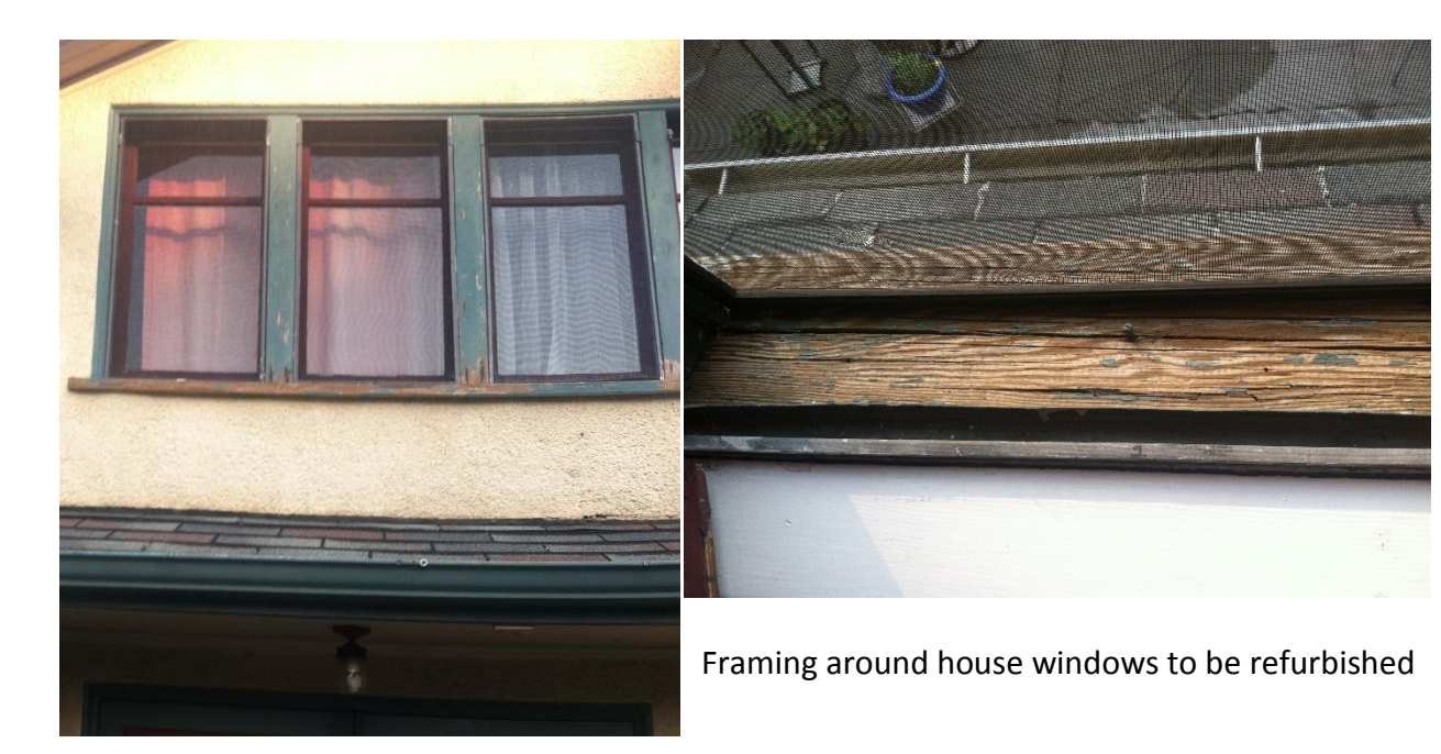
Framing around house windows to be refurbished