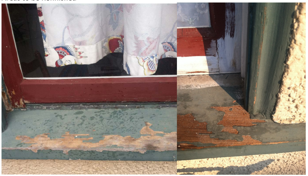
Sills on outside of home