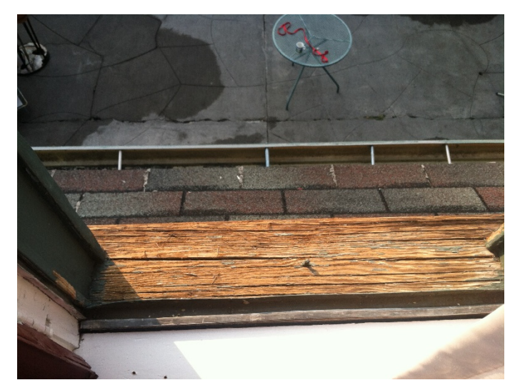
Framing around window to be refinished