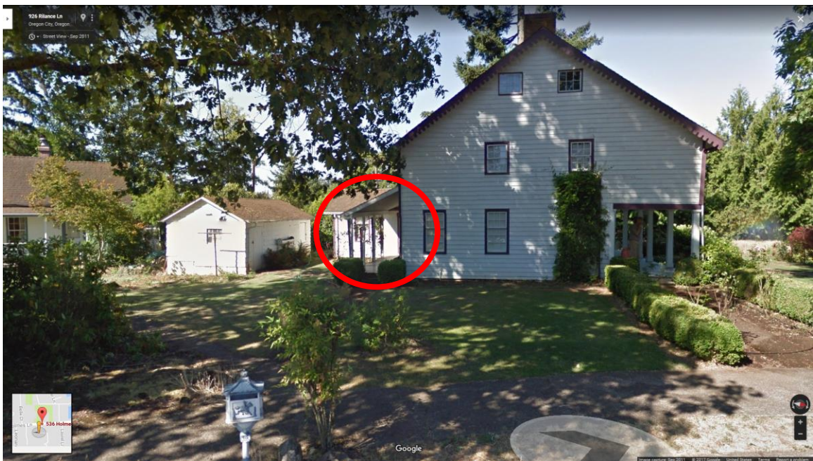
Location of Porch