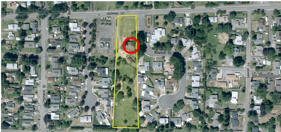
Location of William L. Holmes House (at Rose Farm Museum)