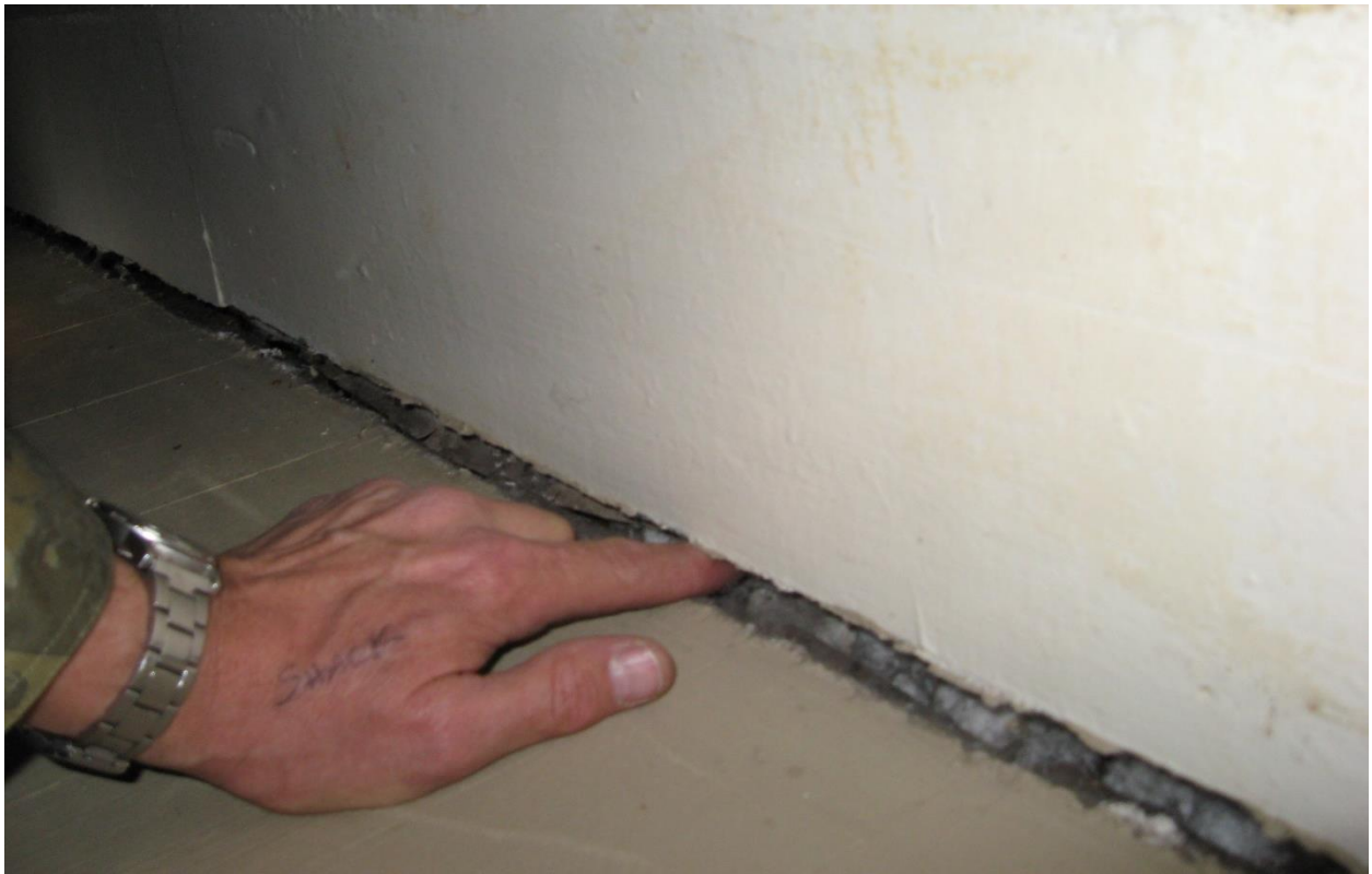
Figure 9. Drop in floor on second floor