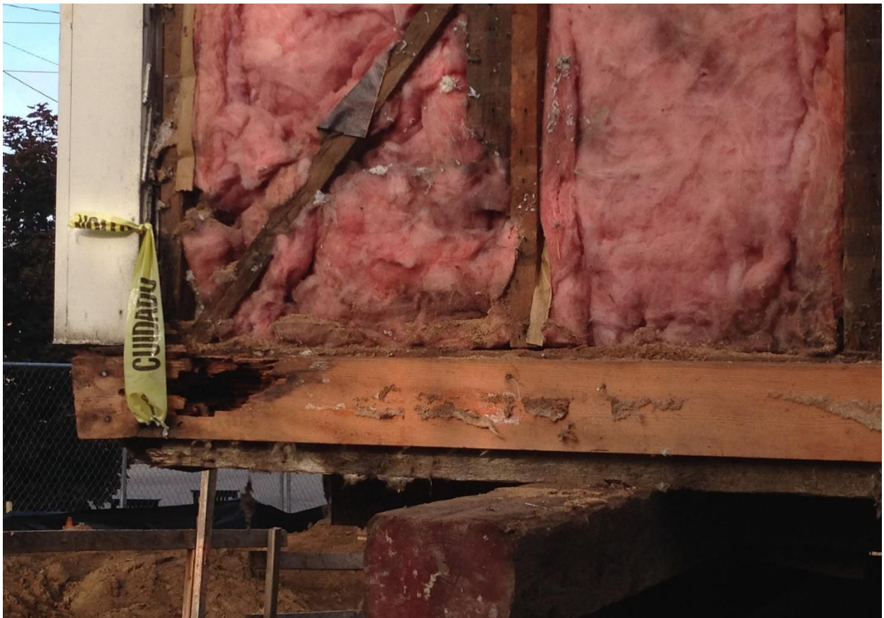
Figure 10. Insect damage