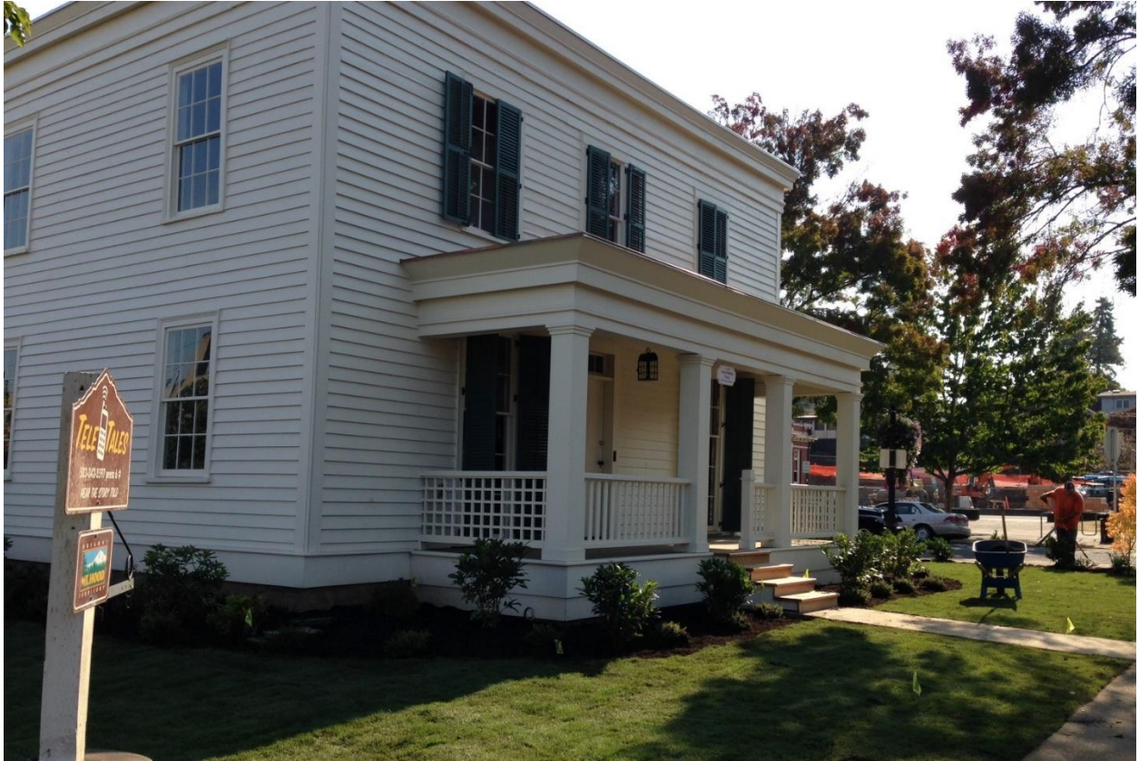
Figure 14. Exterior of Ermatinger House (September 2015)