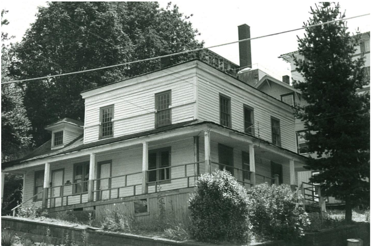
Figure 2. Ermatinger House at 11 th and Center Street.