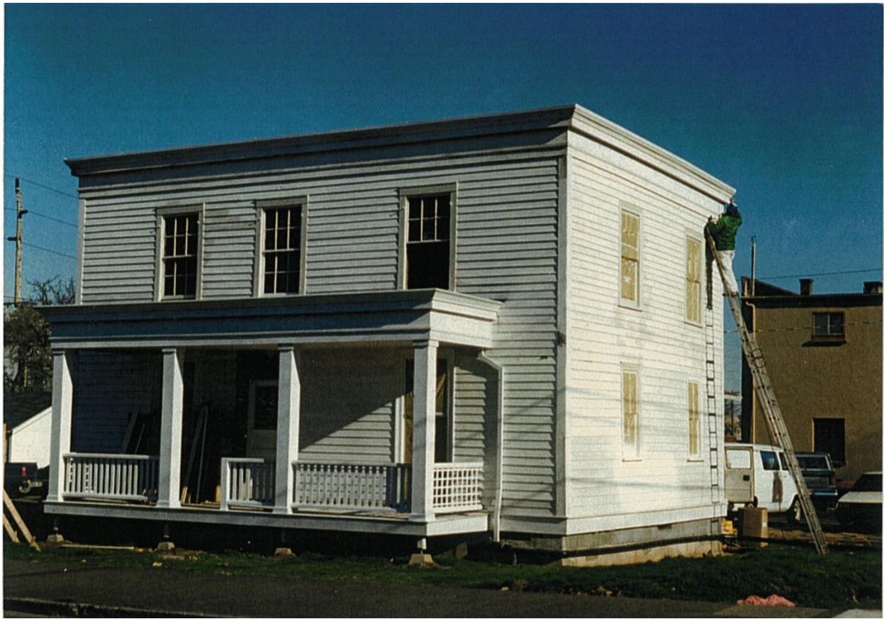
Figure 4. After moving to 6 th and John Adams