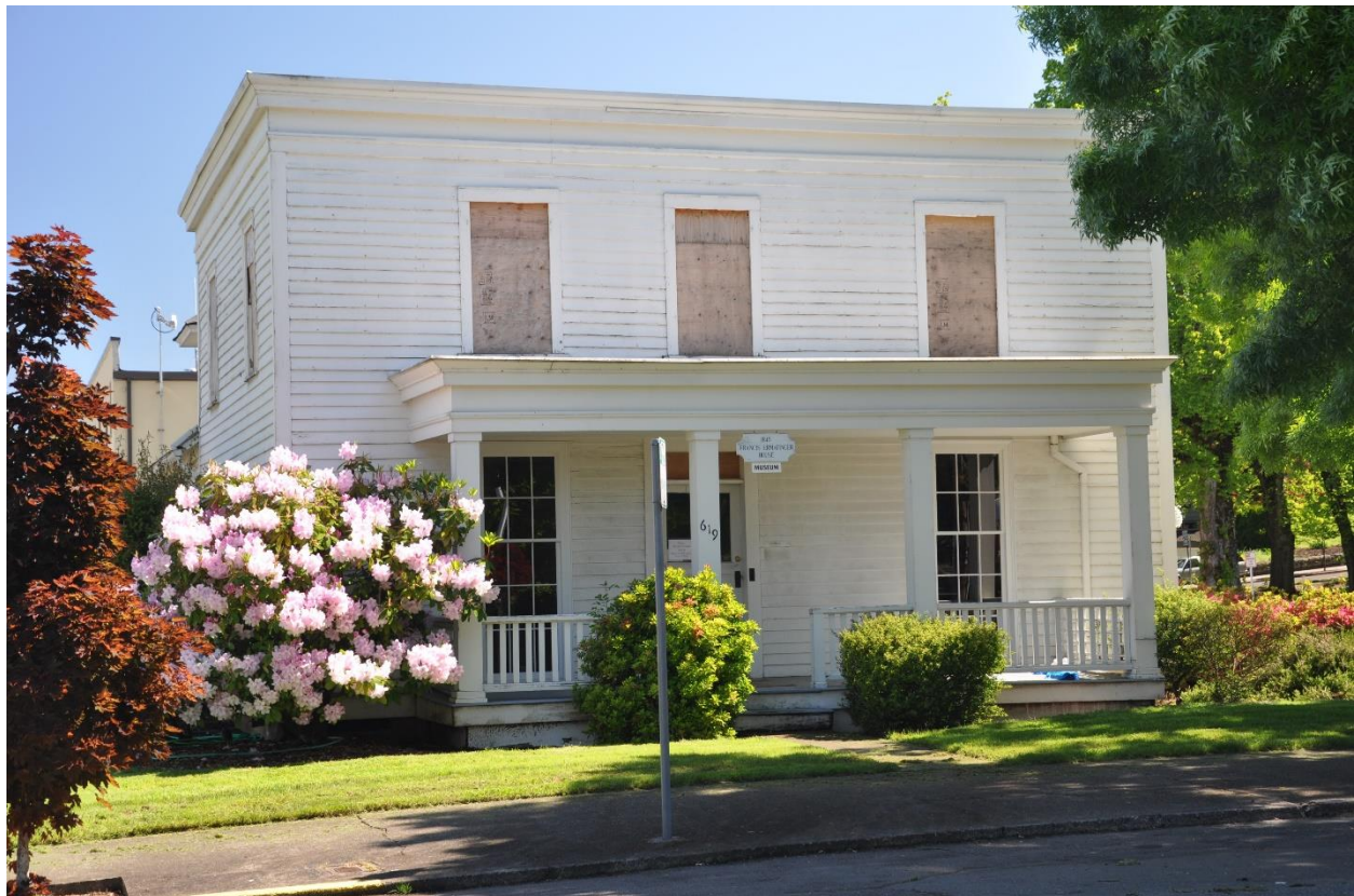
Figure 5. Ermatinger closure 2010-11