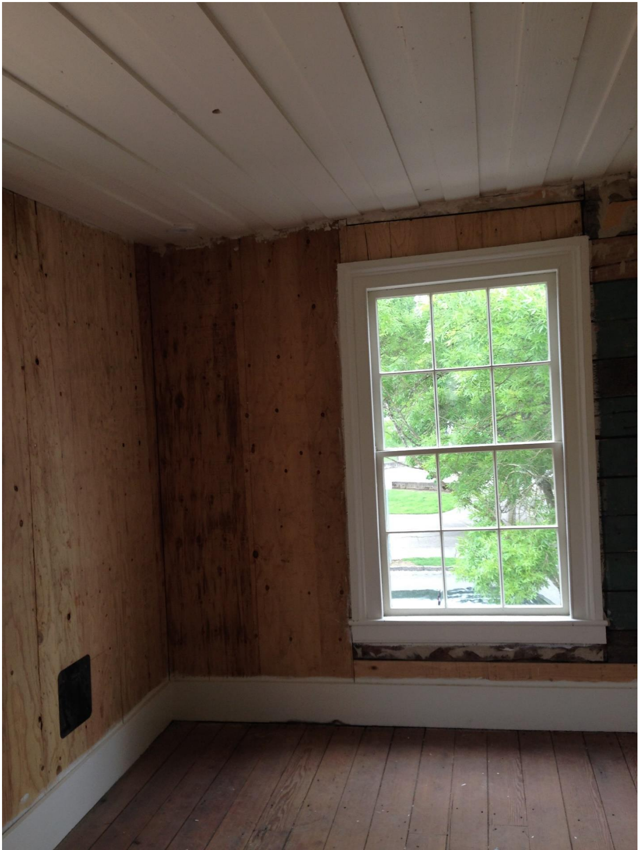
Figure 17. Example of sheer wall