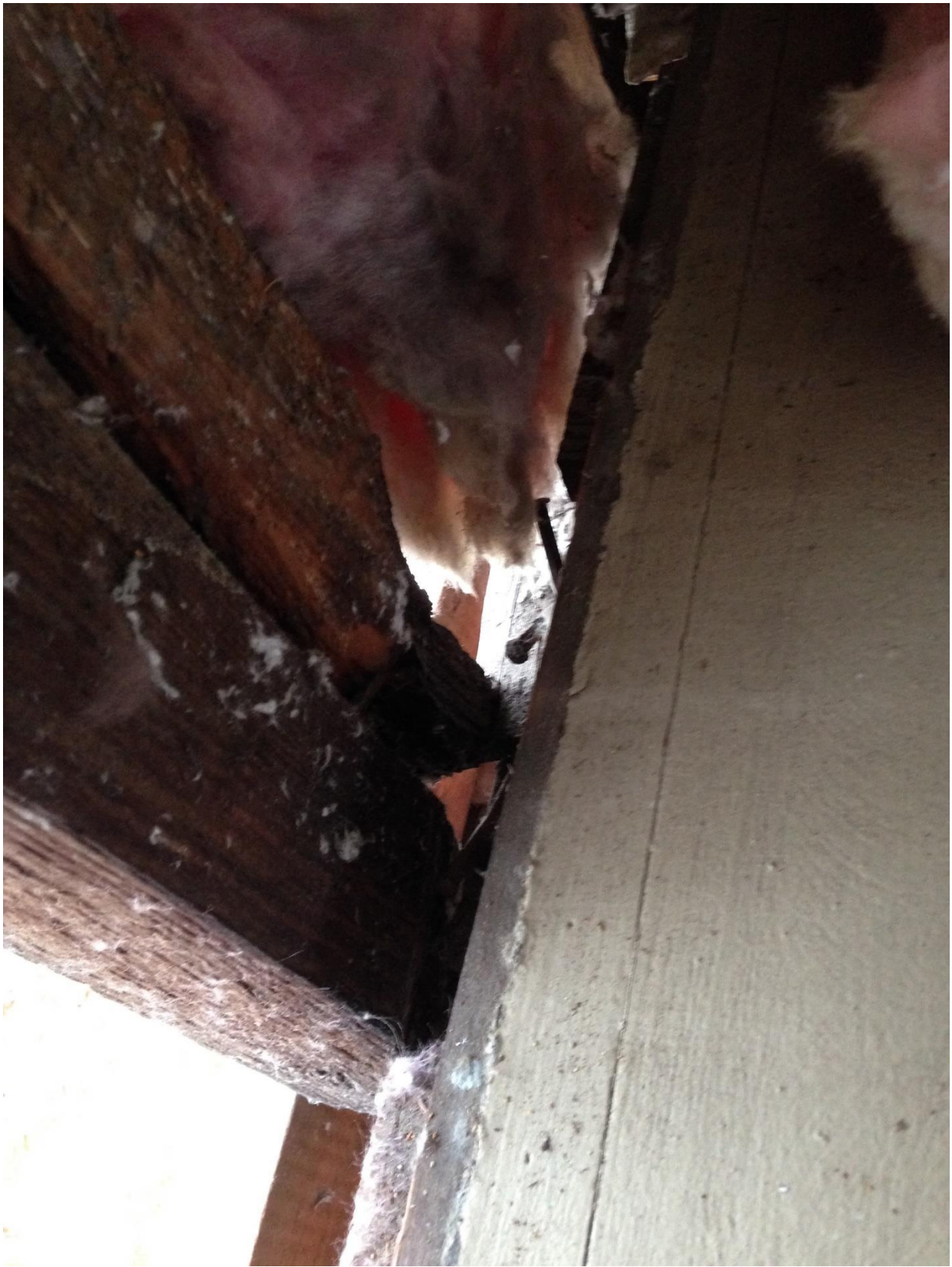
Figure 11. Post and frame rot