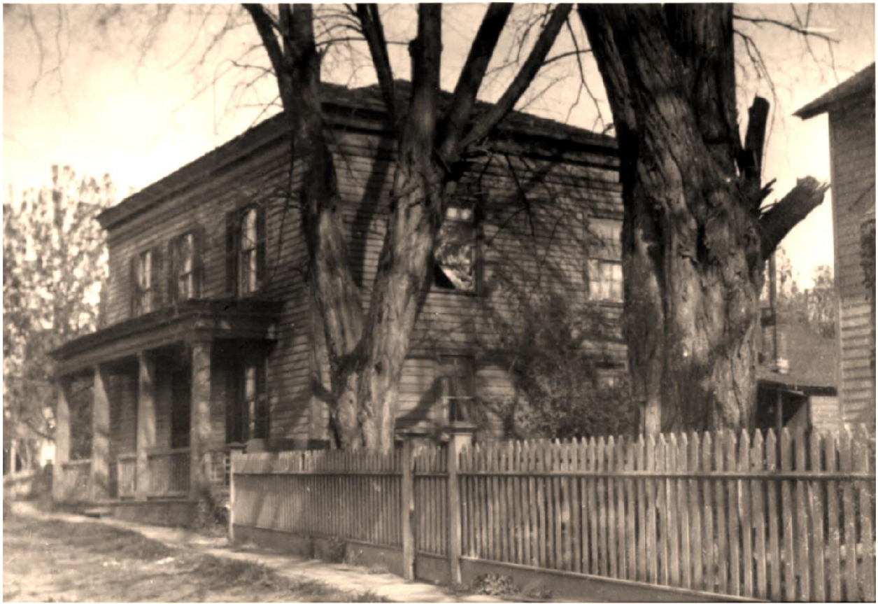
Figure 1. Original Ermatinger House (built around 1845)