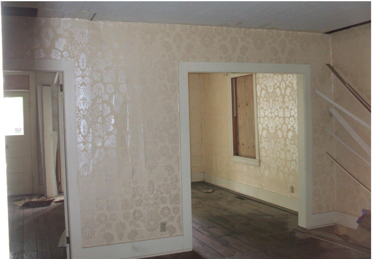
Figure 12. Wallpaper walls on first floor