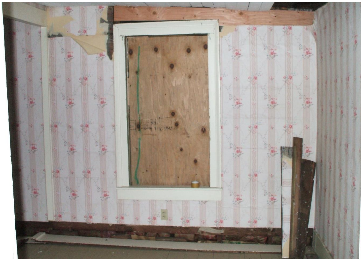
Figure 13. Wallpaper walls on second floor