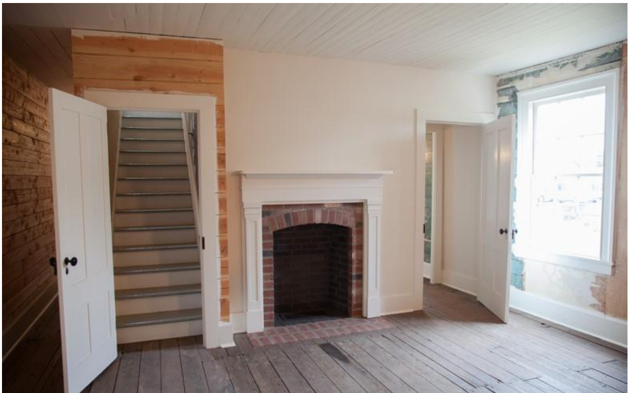
Figure 15. Fireplace with drywall and paint