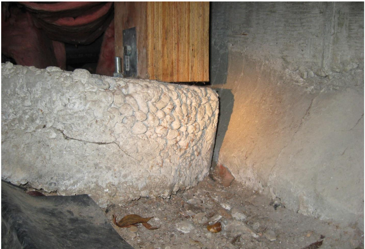
Figure 7. Post and footing