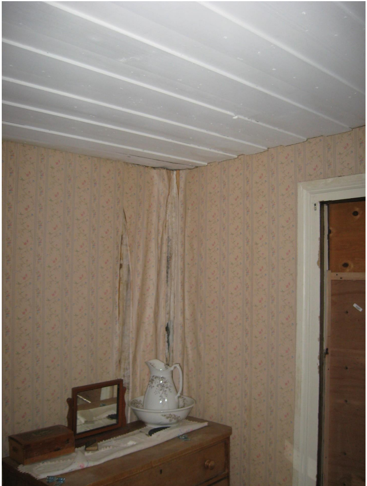
Figure 8. Ermatinger House water damage