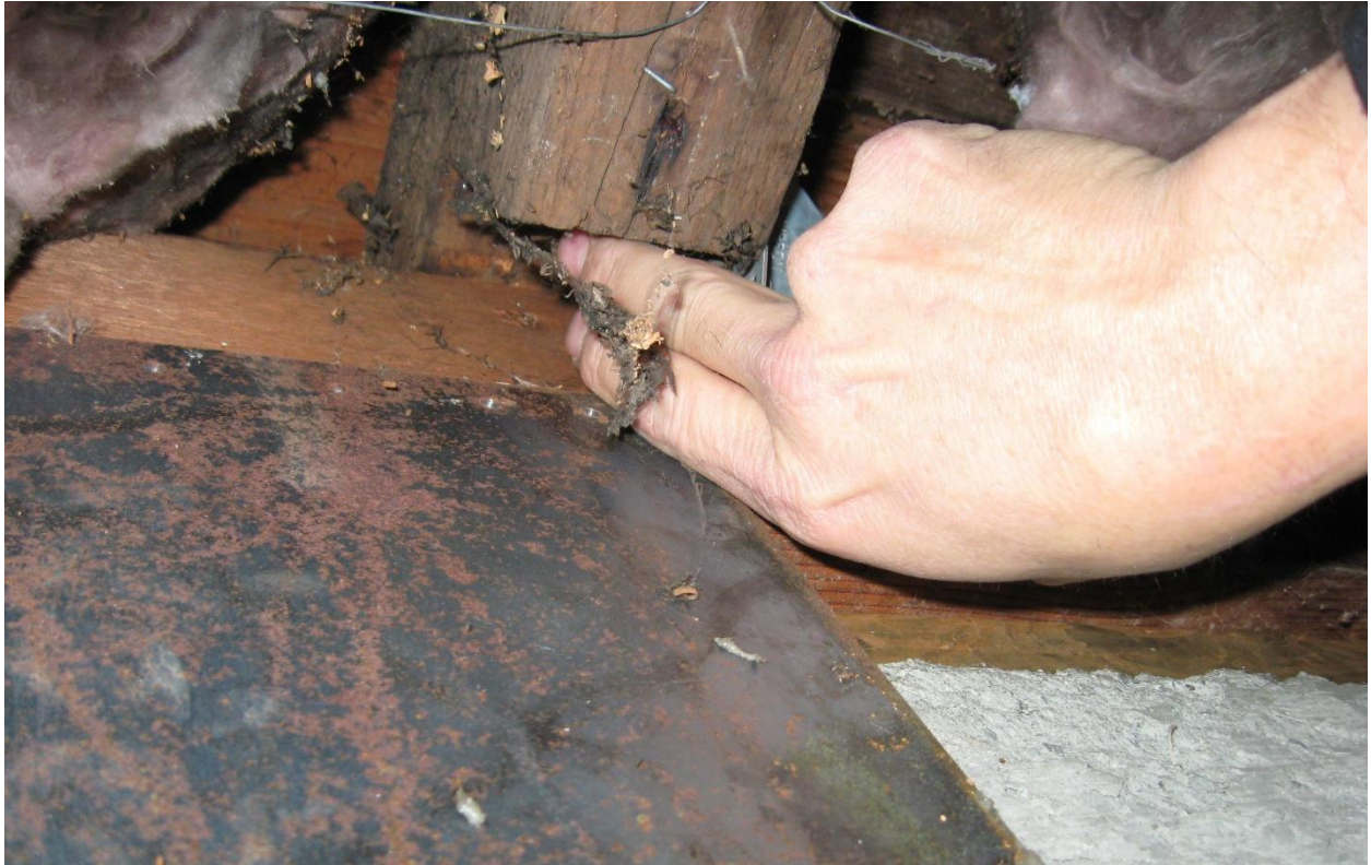
Figure 6. Ermatinger House post failure.