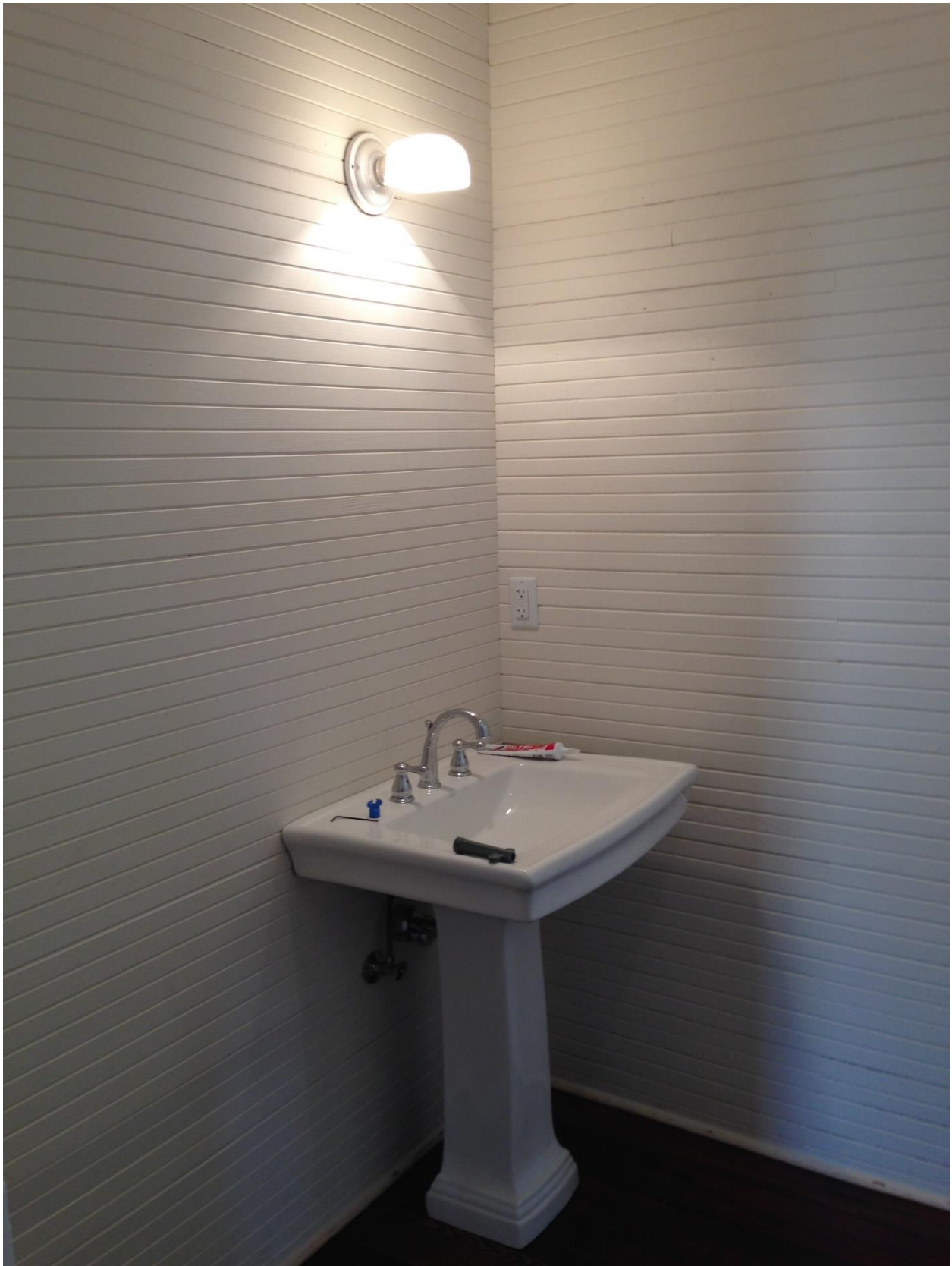
Figure 16. Painted wood in restroom