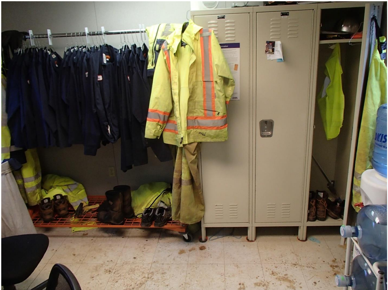
Figure 6. Locker area in rented pod space