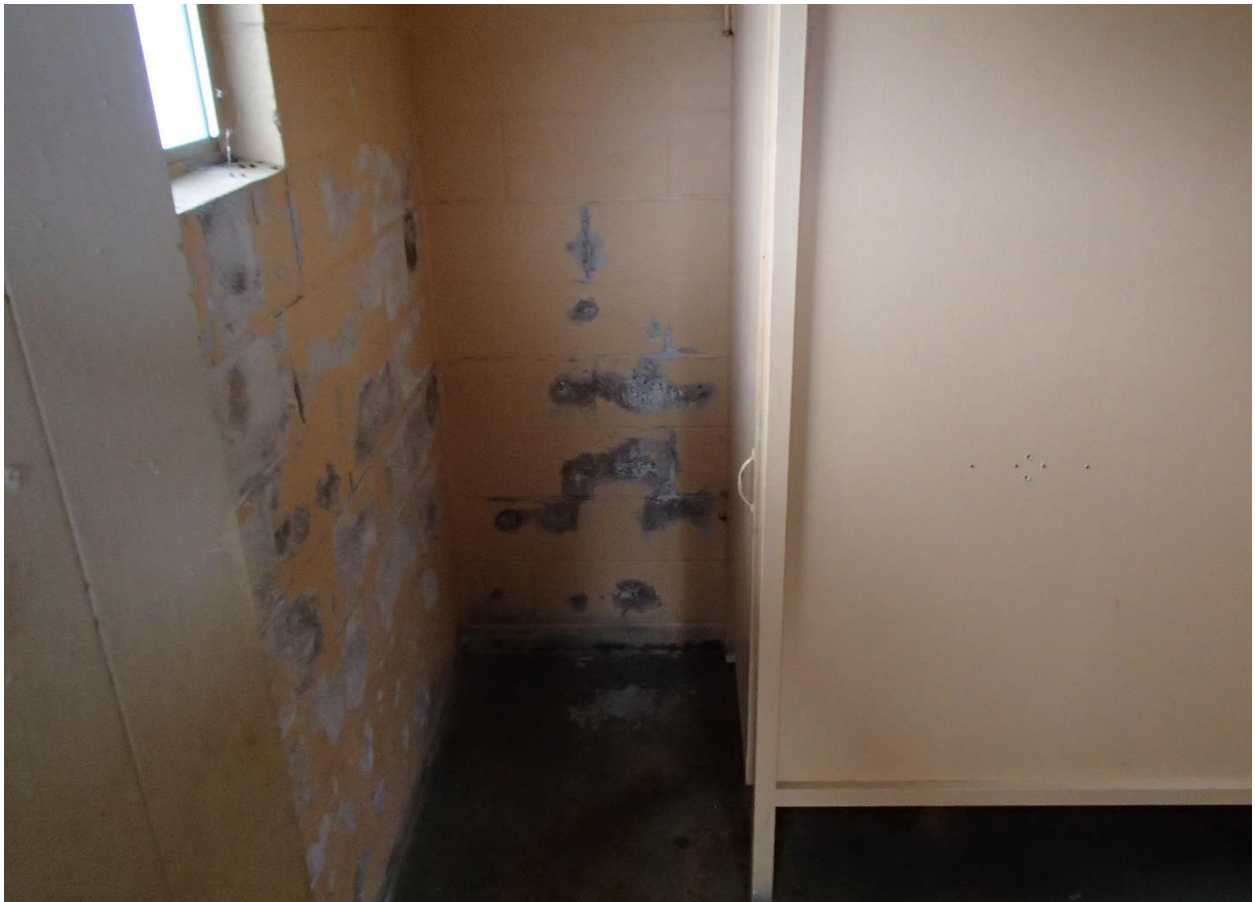
Figure 3. Restroom interior wall moisture