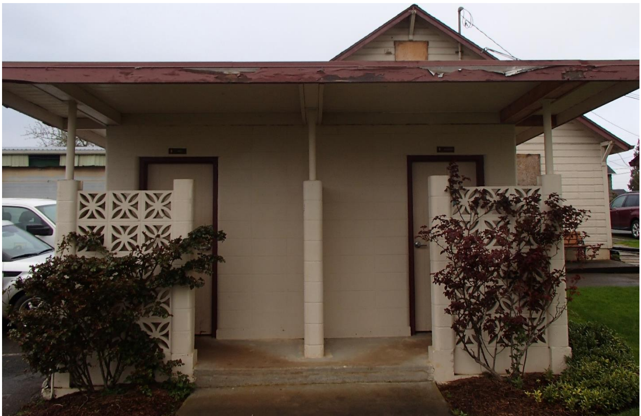
Figure 2. Non-ADA compliant Cemetery public restroom building