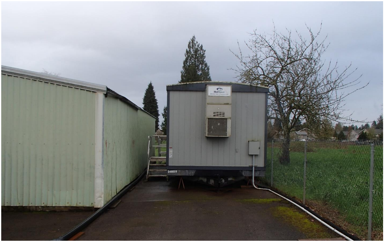
Figure 5. Rented pod unit for park operations staff