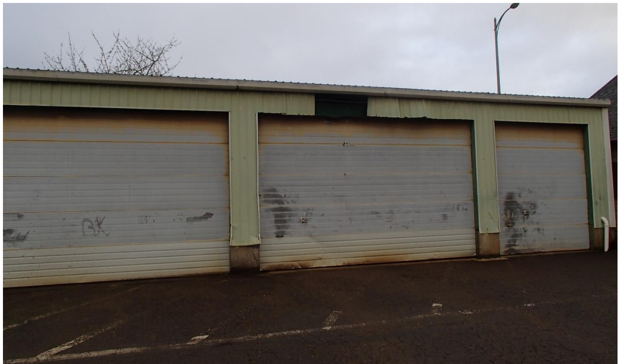
Figure 8. Adjacent metal shop building, not included in project