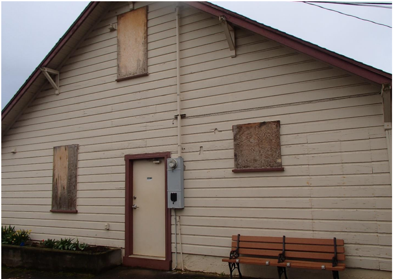
Figure 1. Park Operations Building which is currently unusable due to structural failures.