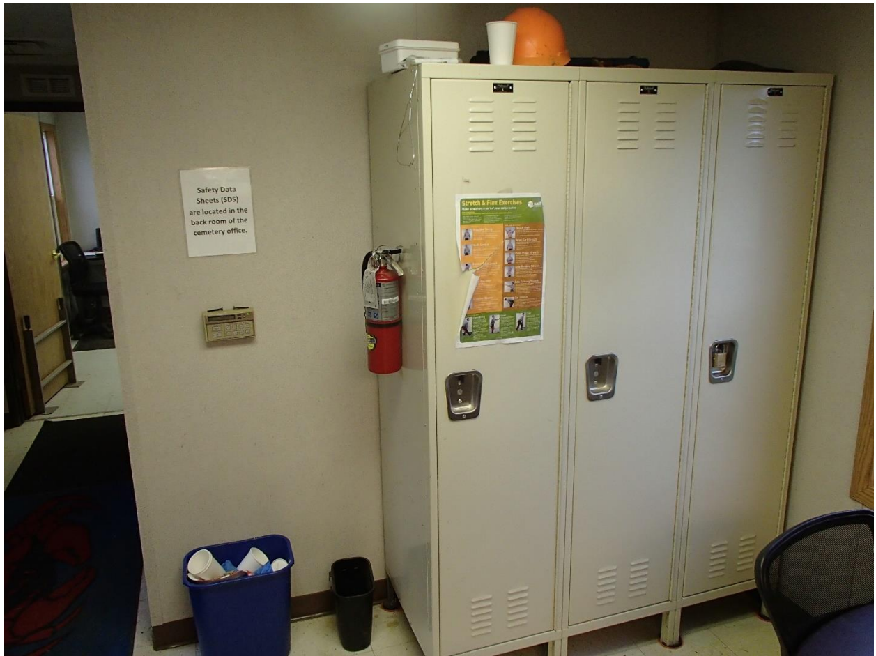
Figure 7. locker area in rented pod space