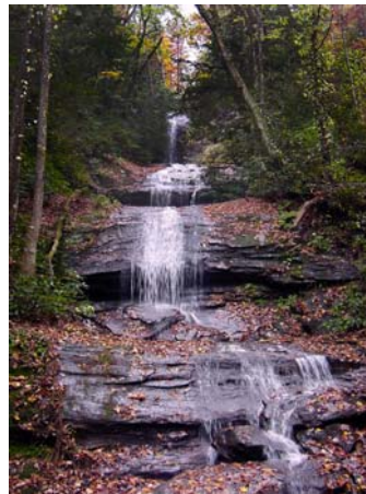
DeSoto Falls, Georgia

Yes, Willamette Falls is clearly a magnificent and unique waterfall! But my heart belongs to another . . . my husband proposed after a rain-soaked hike to a discreet waterfall just outside of Dahlonega, Ga.