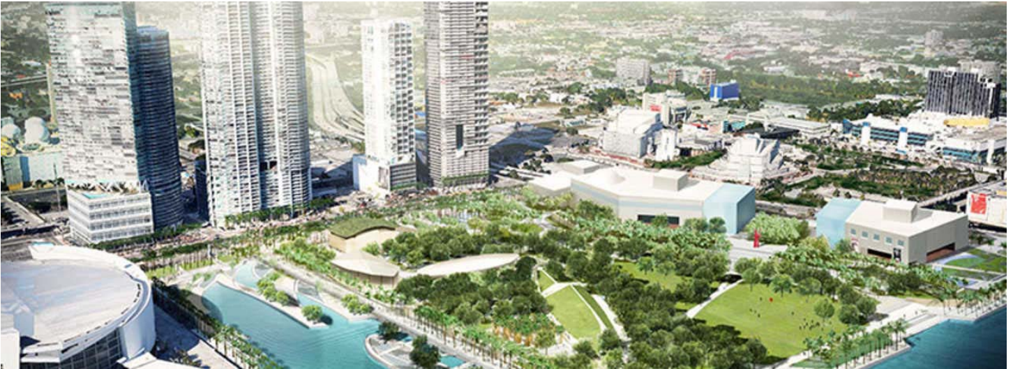
Rendering of Museum Park Miami, credit Civitas, Inc.