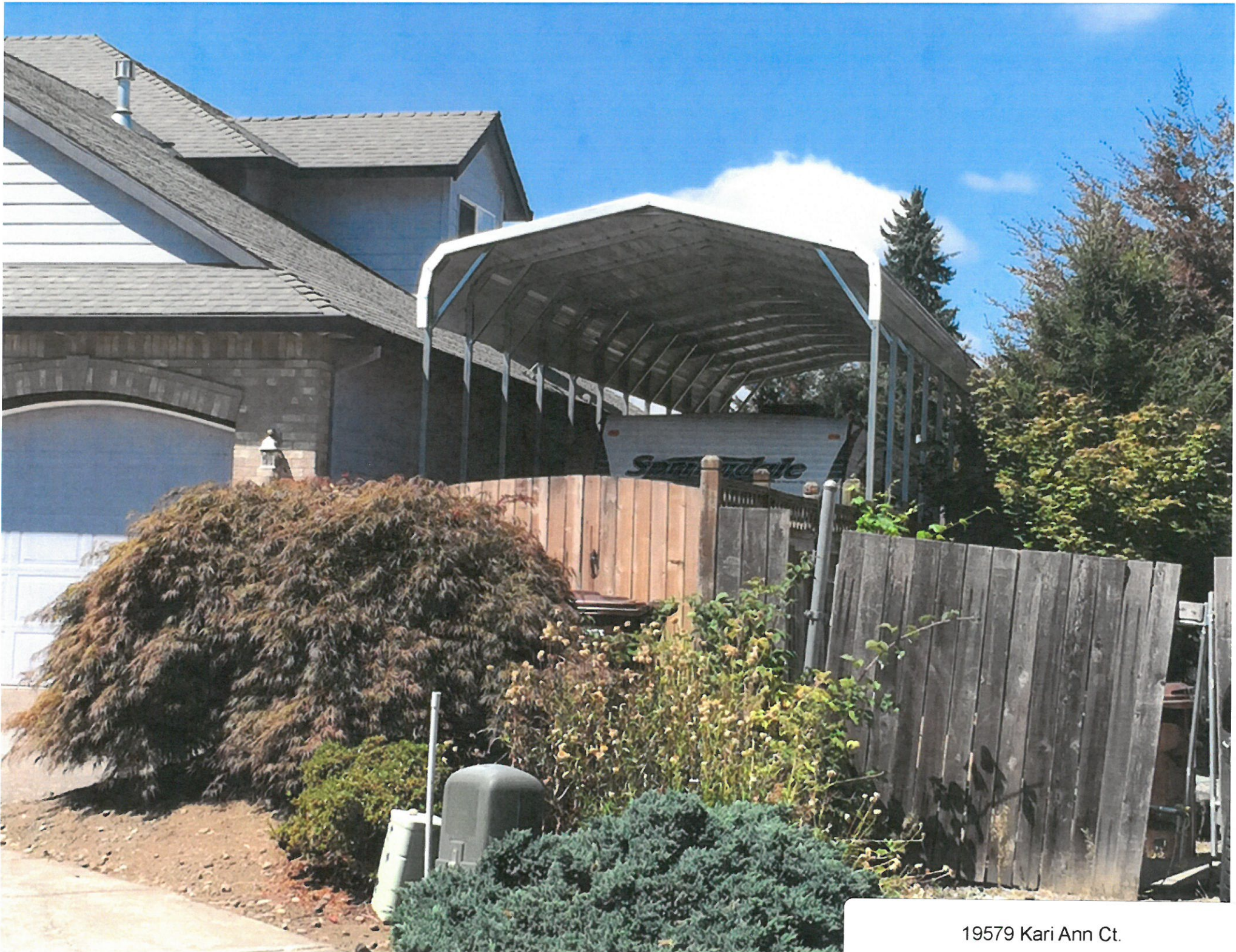
19579 Kari Ann Ct.