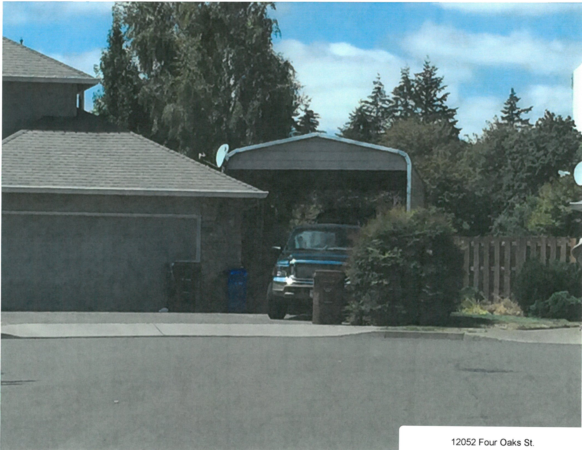
12052 Four Oaks St.