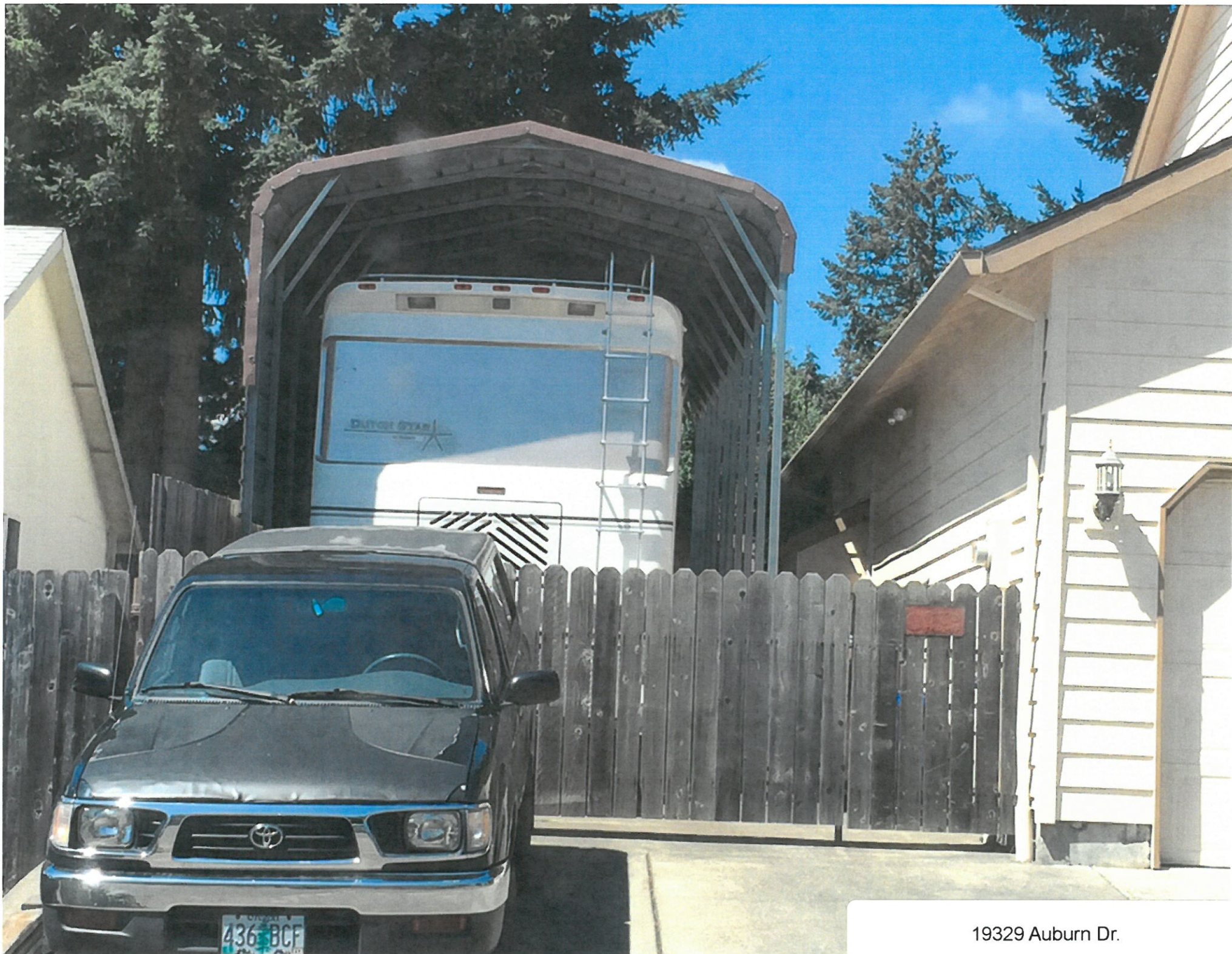
19329 Auburn Dr.