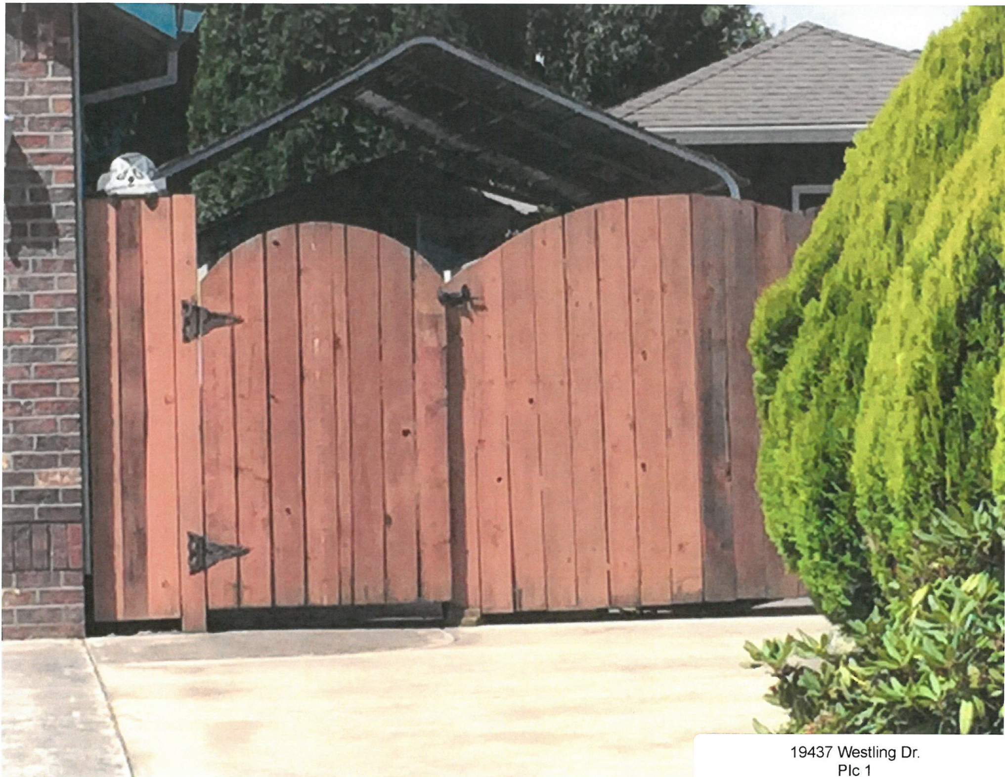
19437 Westling Dr. Plc 1