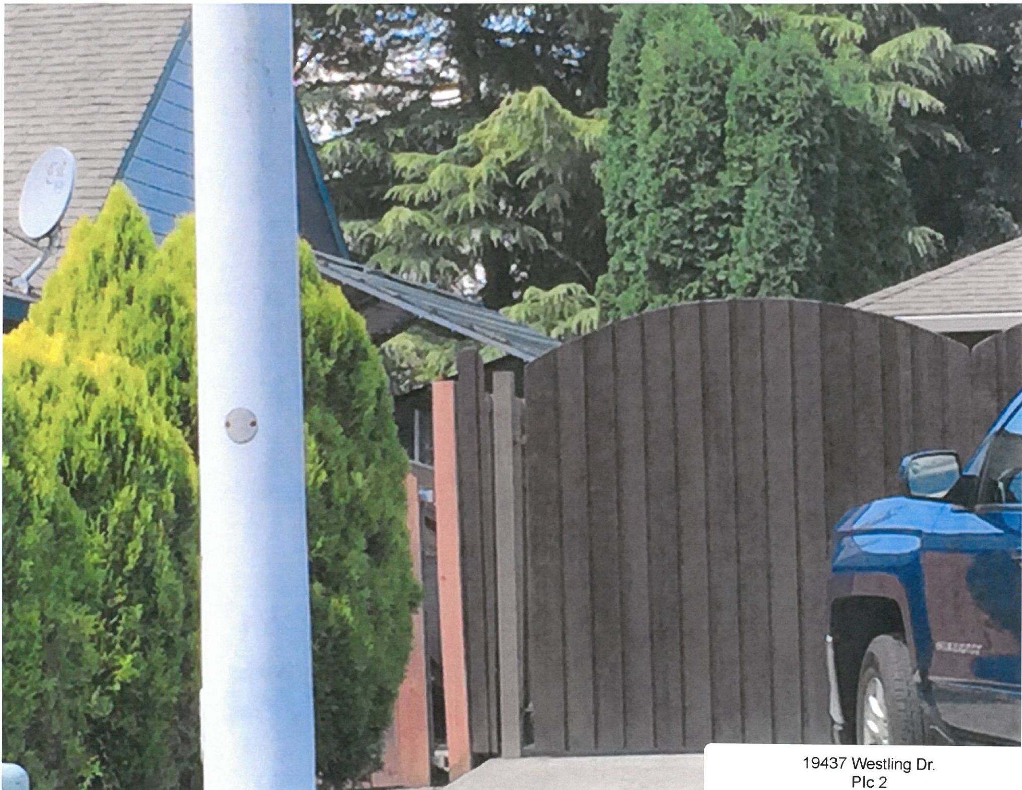
19437 Westling Dr. Plc 2