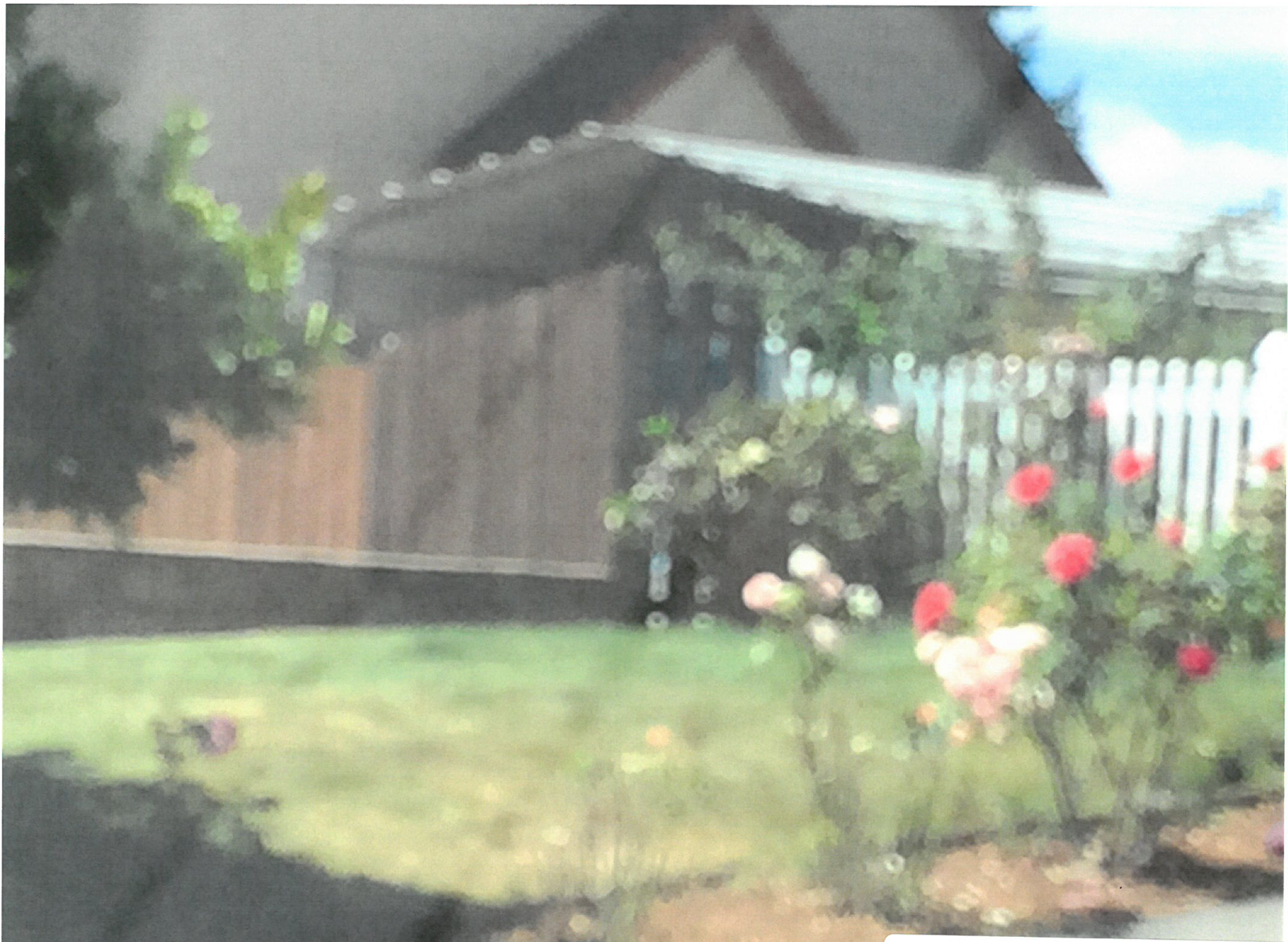
19379 Vincent Dr. Pic 2