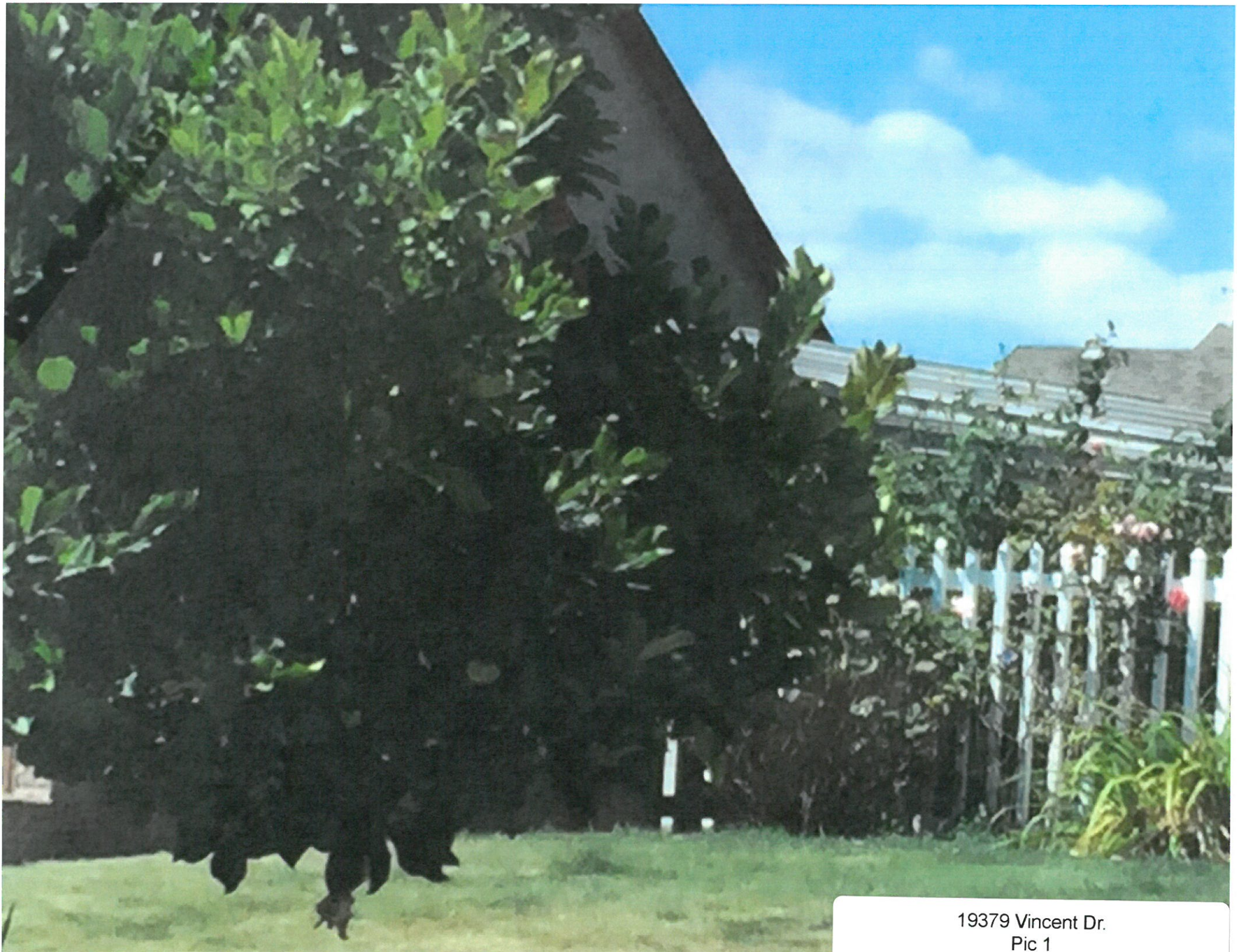
19379 Vincent Dr. Pic 1