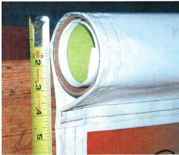
Banner Pocket 4"