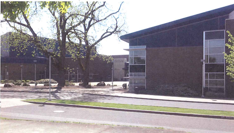
High School Entry