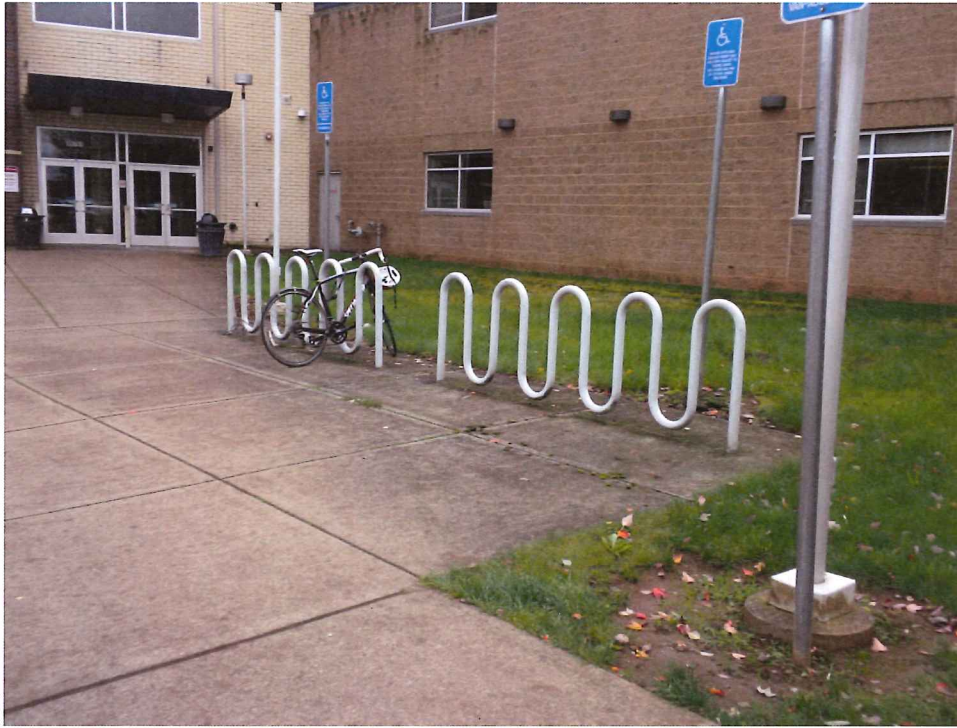
Unused/underutilized bike racks