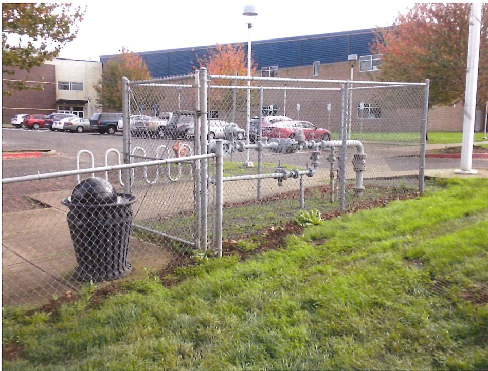
Existing chain link screen/fence