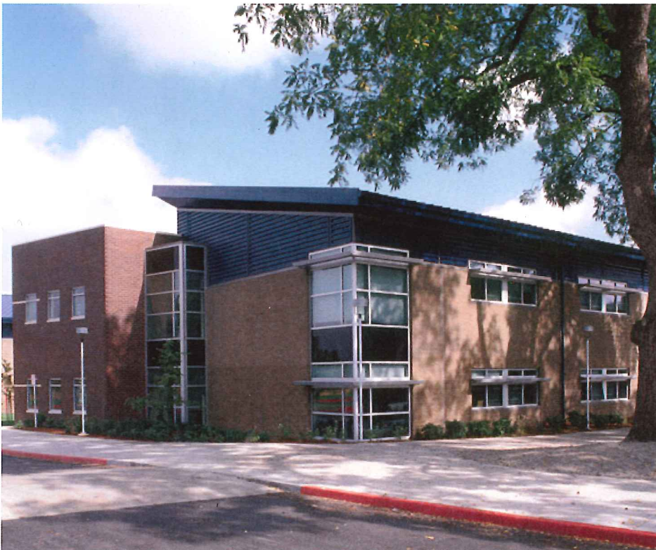
Typical Exterior Classroom Wing Finishes