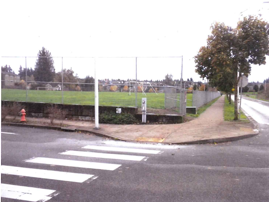
Chain link fence along perimeter of existing High School Site/Athletic Fields