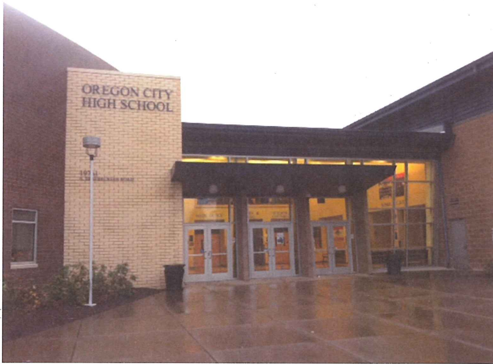
High School Entry