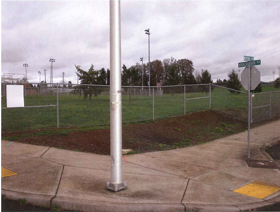
Chain link fence along perimeter of existing High School Site/Athletic Fields