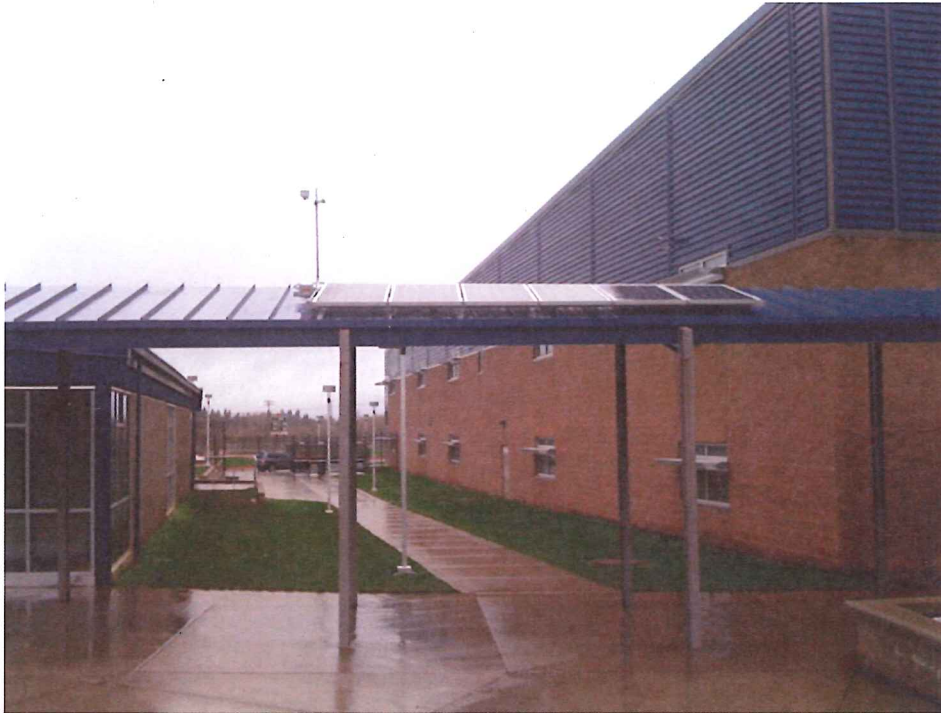
High School Courtyard