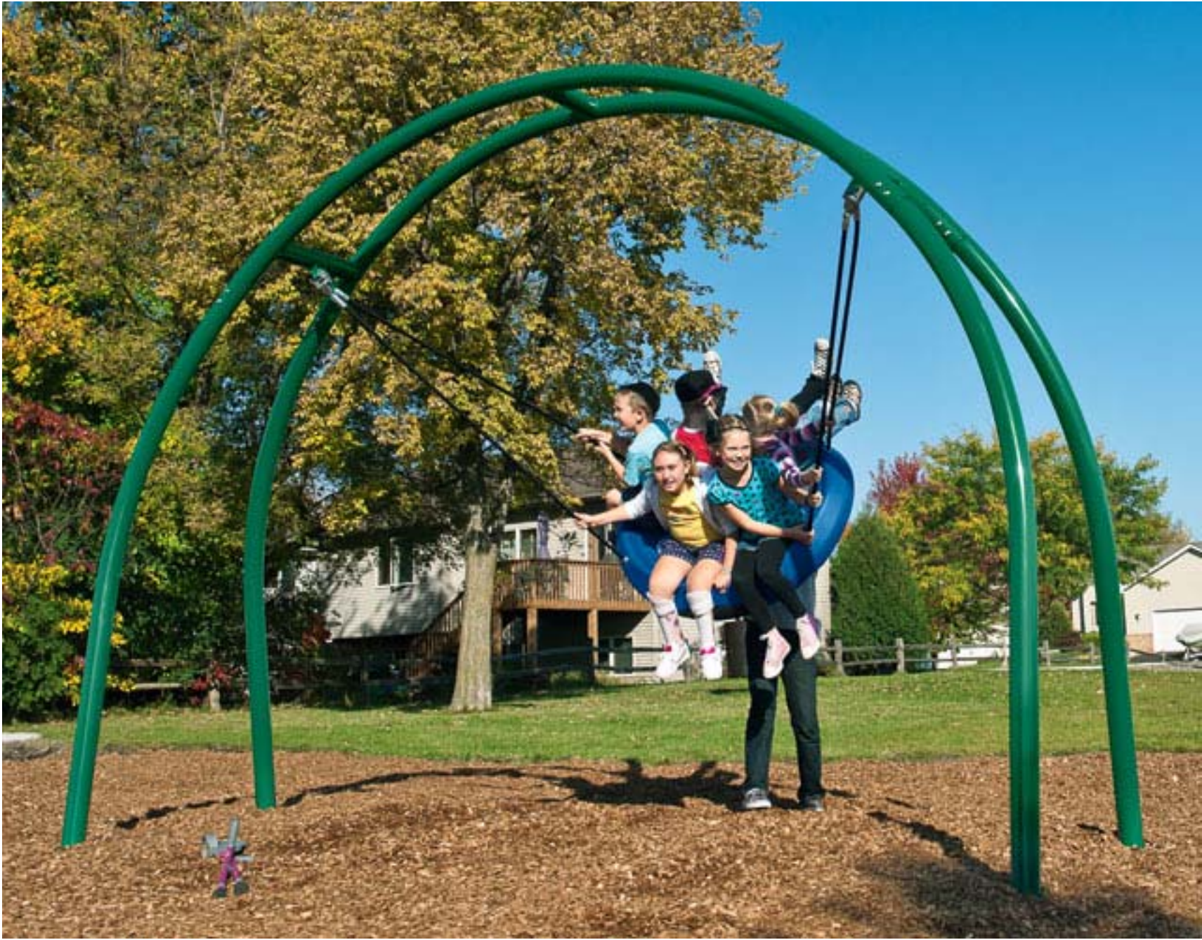
Structured Play Element