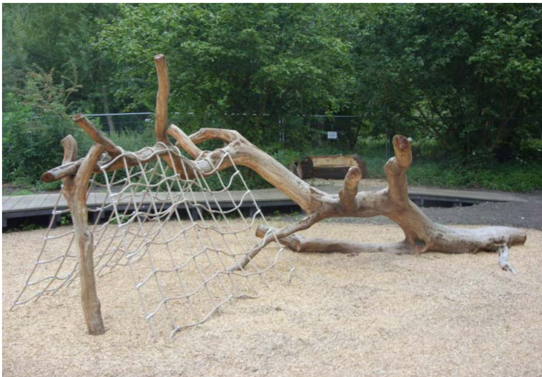
Nature Play Climbing Structure