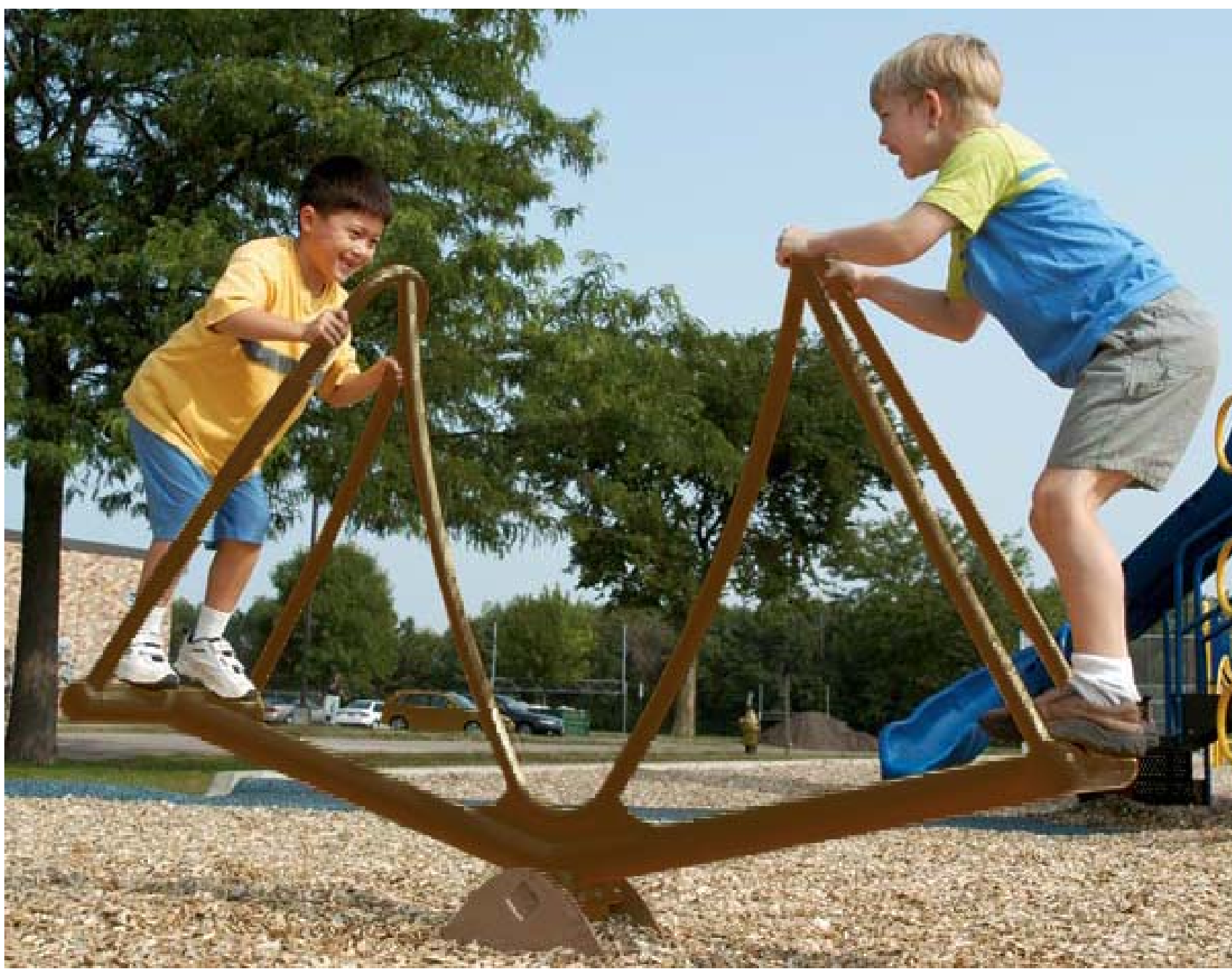
Structured Play Element