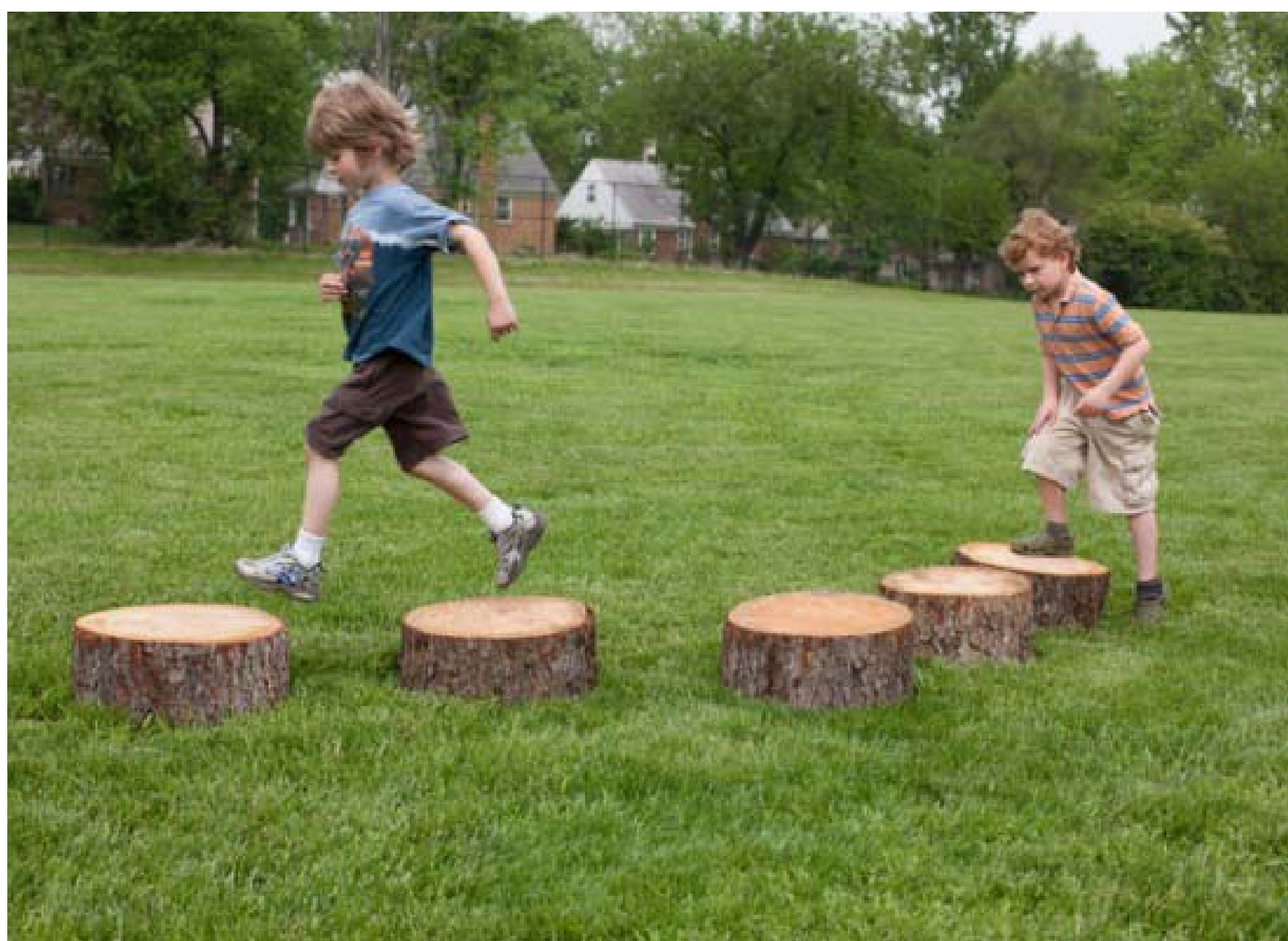
Nature Play Stepping Stumps