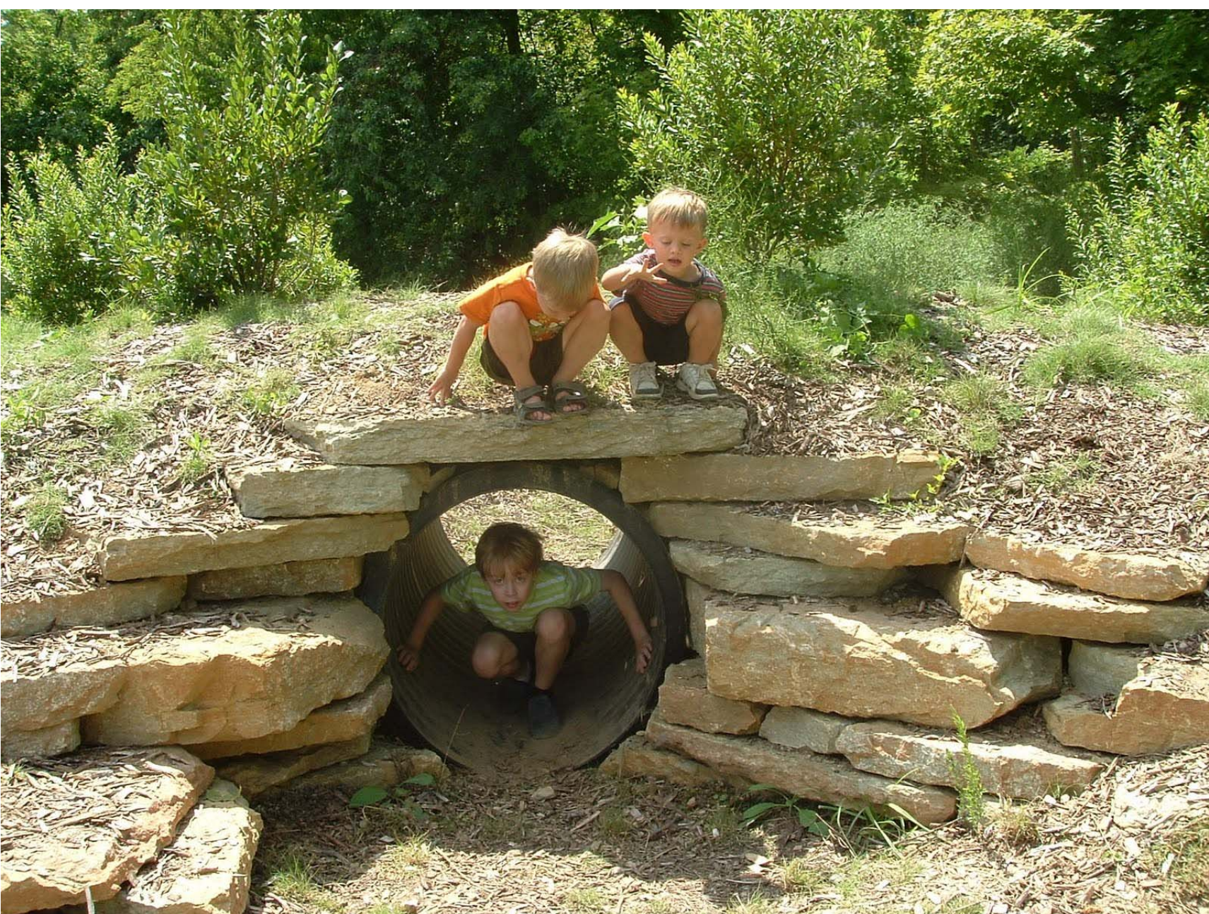
Nature Play Tunnel