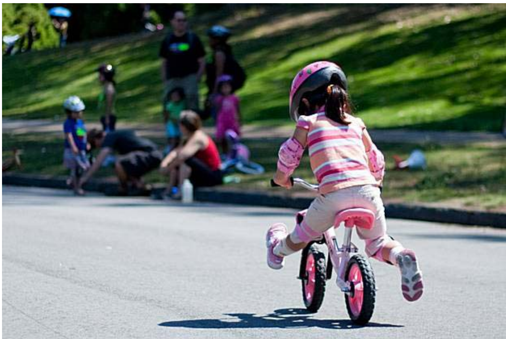
Pathways for Learning