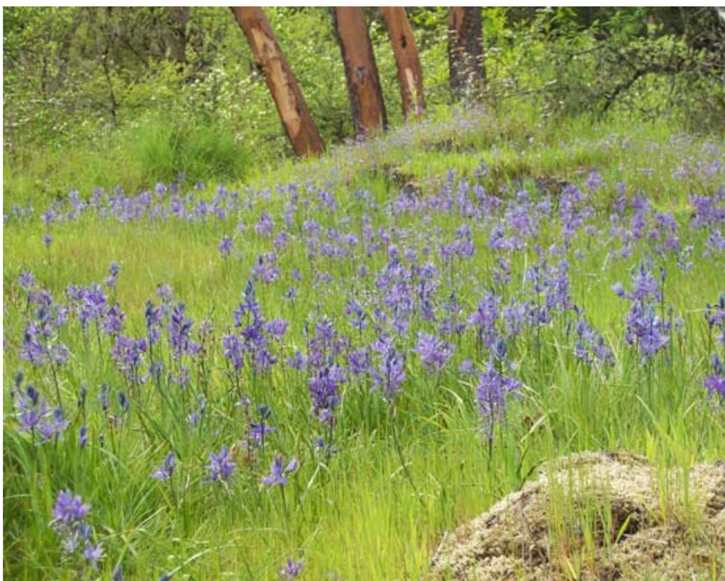
Natural Area Planting