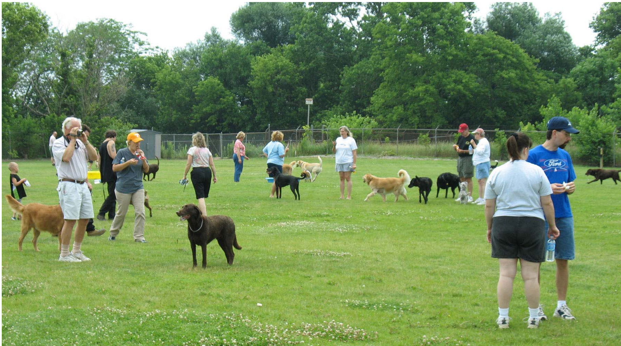
Fenced Dog Park