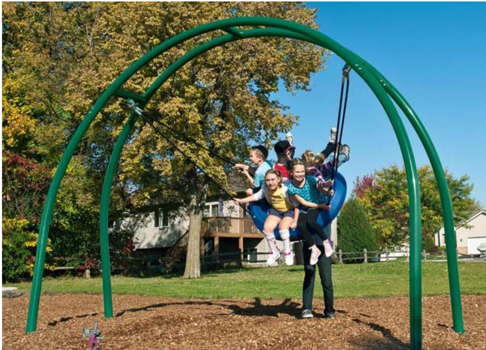
Diverse Structured Play