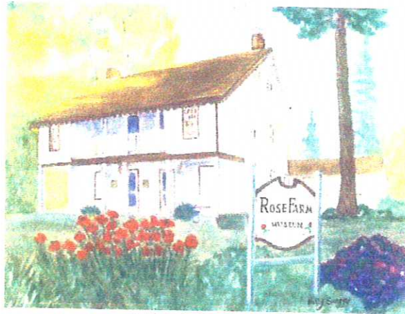
William L. Holmes House at the Rose Farm, 1847 NR 536 Holmes Lane at Rilance Lane, Oregon City