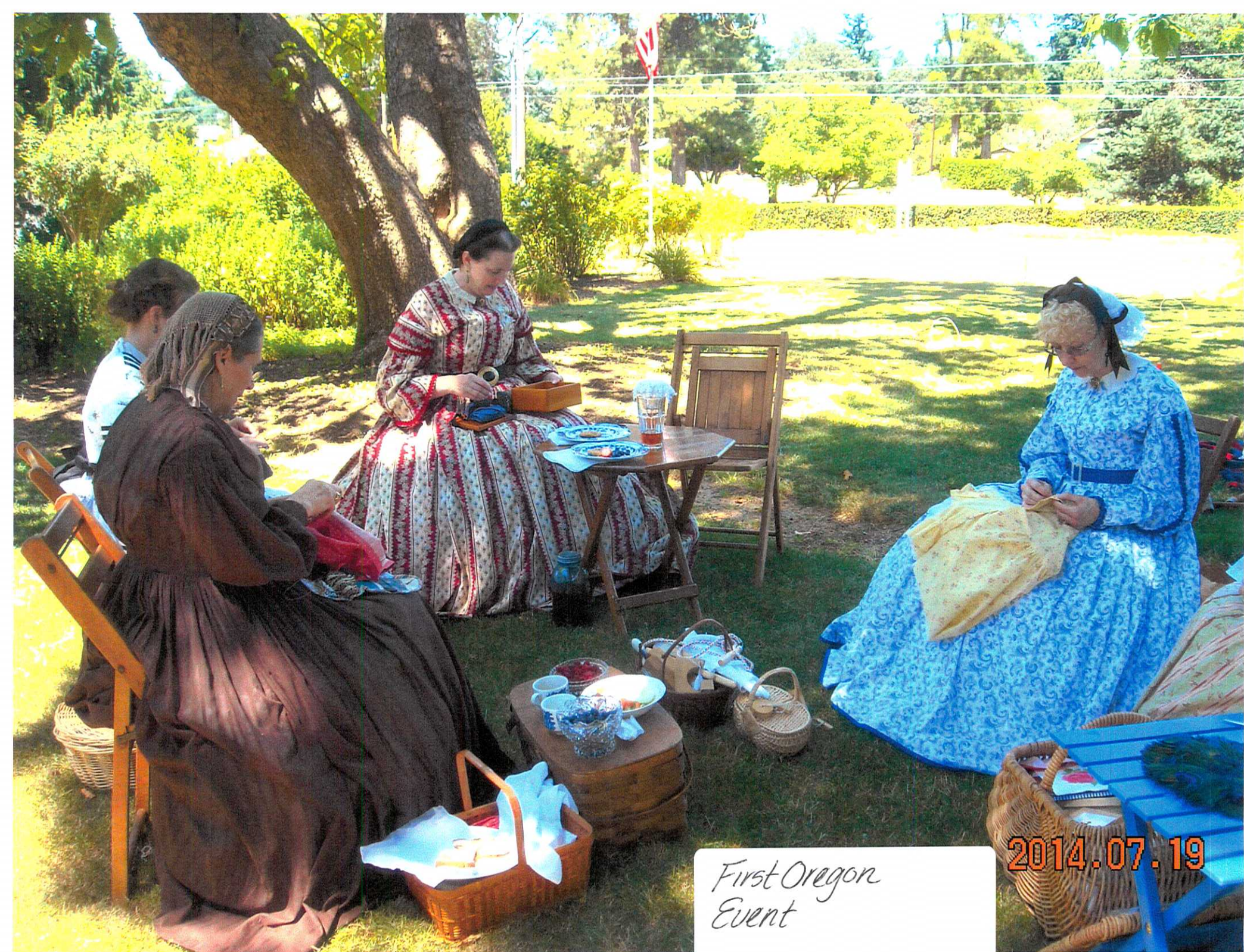
First Oregon Event