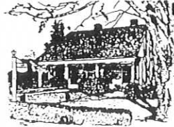
The McLoughlin House, 1846, National Historic Site