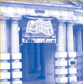
Banners must be securely mounted on a structure.

For more detailed information regarding the bureau's hours of operation and available services;