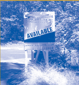
Examples of a properly displayed temporary lawn sign and a temporary freestanding sign

The information in this publication is an overview of portable and temporary sign regulations. Please contact BDS staff to get more detailed information. Sign fee information, permit applications and registration forms are available online and in the Development Services Center (DSC).