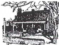
The McLoughlin House, 1846, National Historic Site