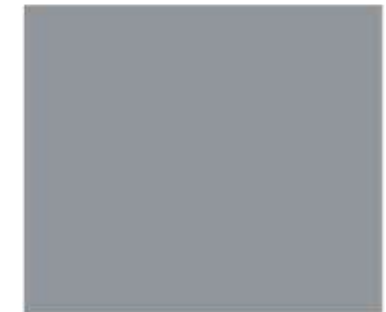
Stairway to Heaven 0479