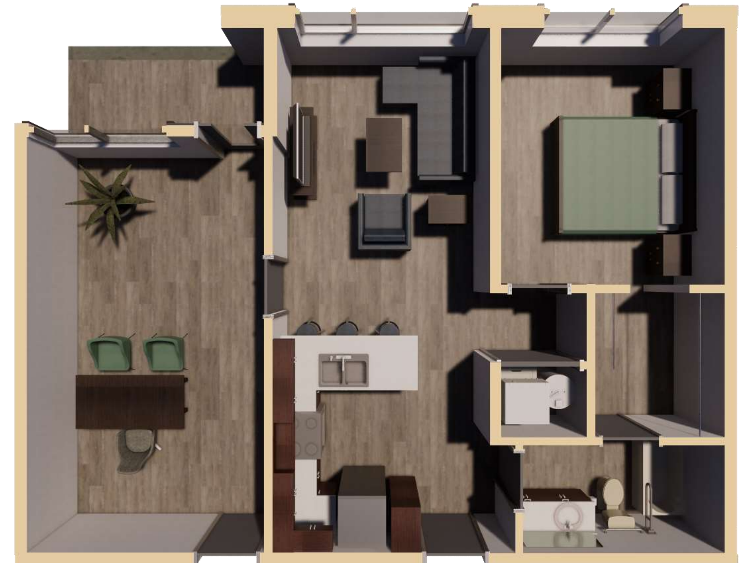
LIVE/WORK ONE BEDROOM