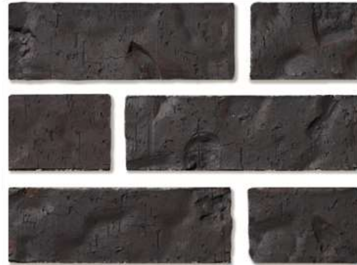
BRICK VENEER BASE, IRON WASH