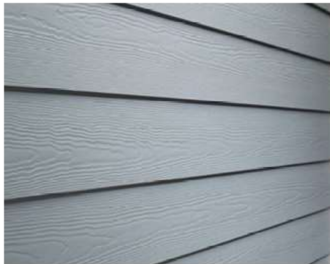
PAINTED FIBER CEMENT LAP SIDING