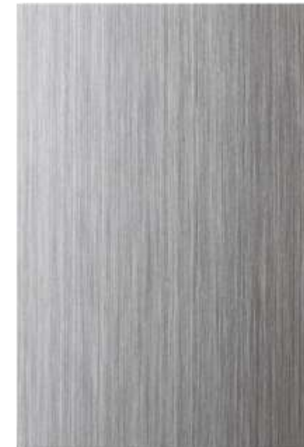
STAINLESS STEEL UNIT DECK RAILINGS