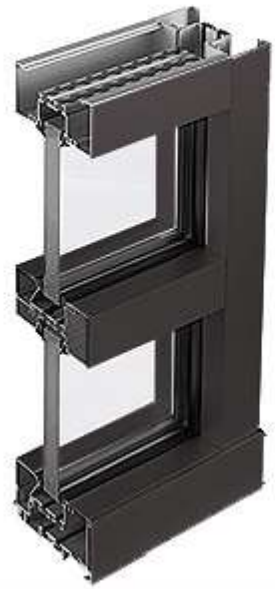
BLACK VINYL AND STORE FRONT WINDOW SYSTEMS