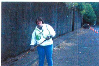
RR AVE REMOVAL of GRASSES