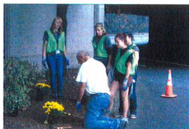
RR AVE -99E SPRING PLANTS