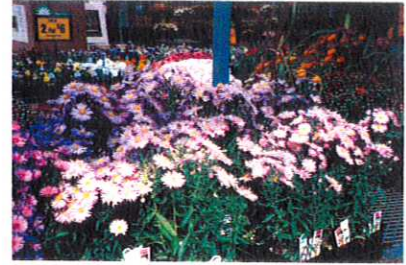
FALL PLANTINGS RR AVENUE