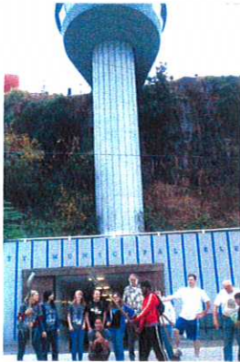
WARNER PACIFIC COL. "Urban Studies Progm."