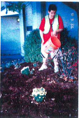
OC JROTC PLANTING