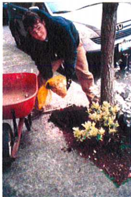
TREE WELLS PLANTING

W I N T E R - S P R I N G W O R K P A R T I E S