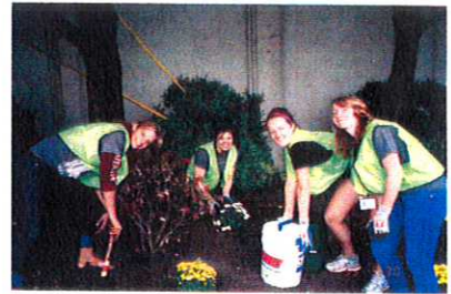
FALL BULBS and CRYSTANTHEUMS