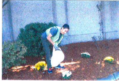
PREPARING FOR FALL PLANTS