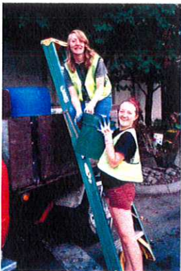
"ELEVATED" PLANTINGS at the Elevator