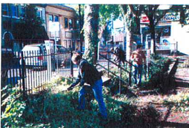
7th and MAIN OVERGROWN PARK for Parking (RESTORED)