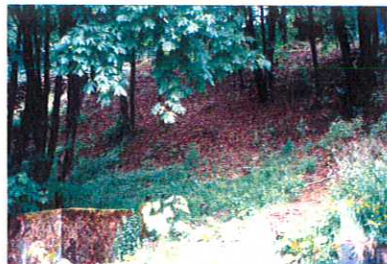
SINGER CREEK FALLS WEEDEAT