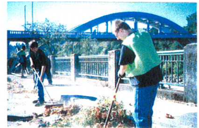
RE-OPENED BRIDGE and 99E BOULEVARD CLEANUP