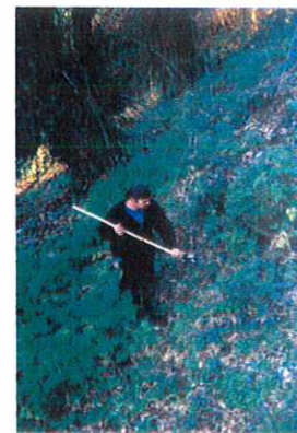
SINGER CREEK HILLSIDE weedeat/replant