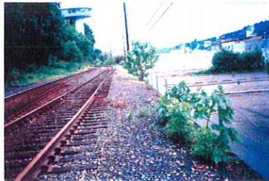
RR AVE OVERGROWTH ABOVE STREET selective removal leaving natives