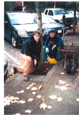
TREE SUCKERS and SOILS RESTORATION