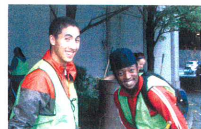
GATEWAY REMULCHING CREW