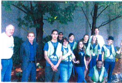
SOUTH GATEWAY PLANTER TEAM