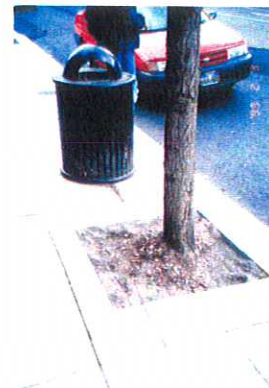
TREE WELLS W/SUCKERS and poor soils