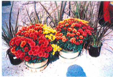
WINTER PLANTS INSTALLED