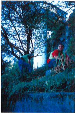
RR AVE PARKING PLANTERS